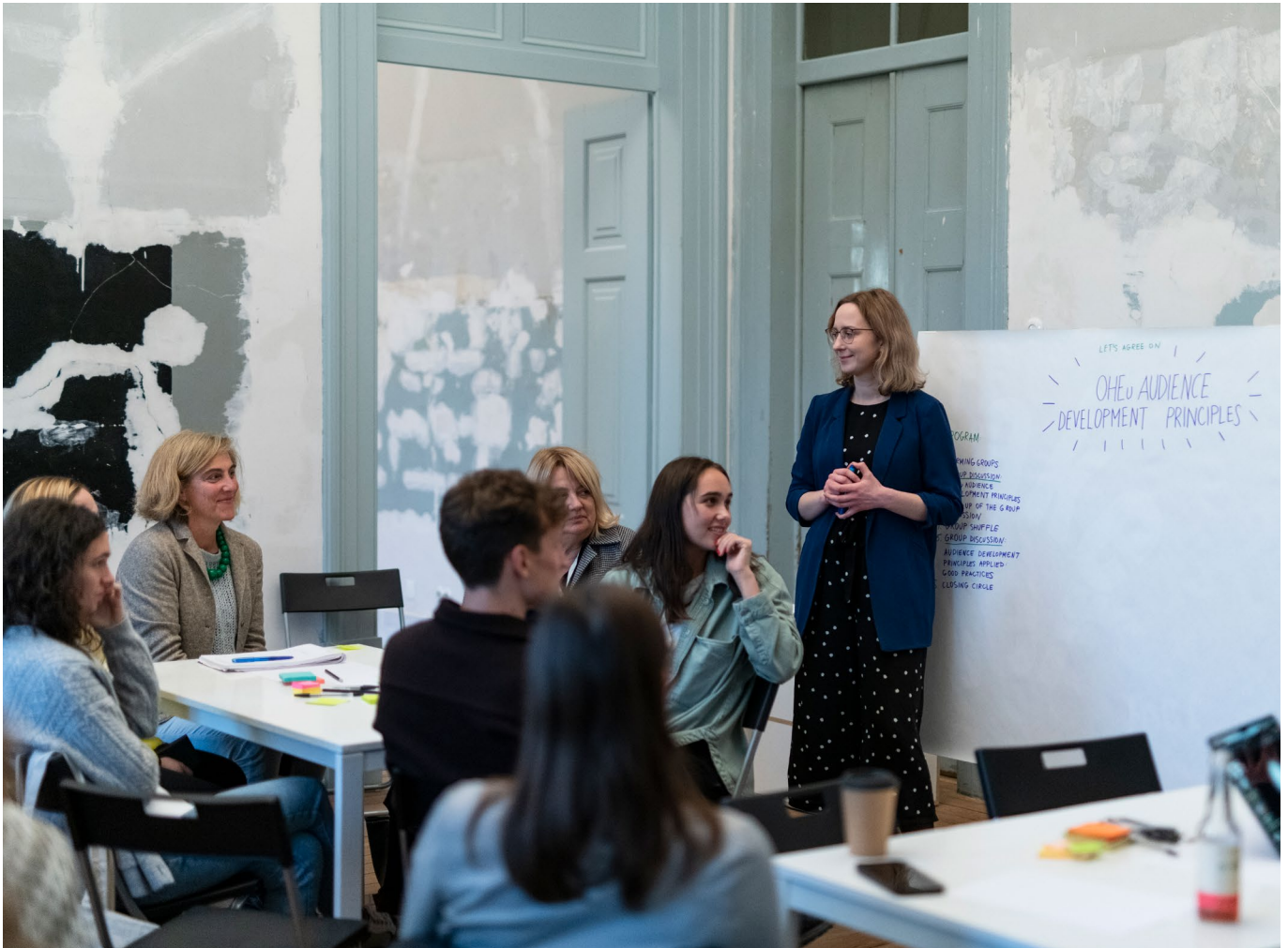
'Perspectives on the Implementation of the Guide' workshop.