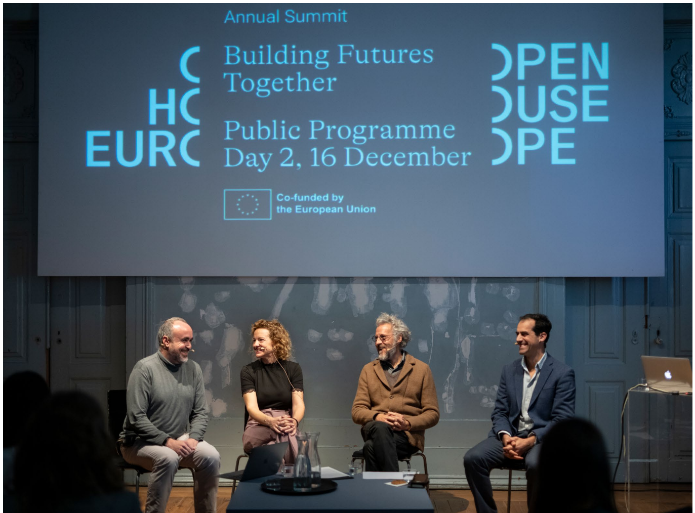
'Achieving Sustainability in Architecture' public debate.