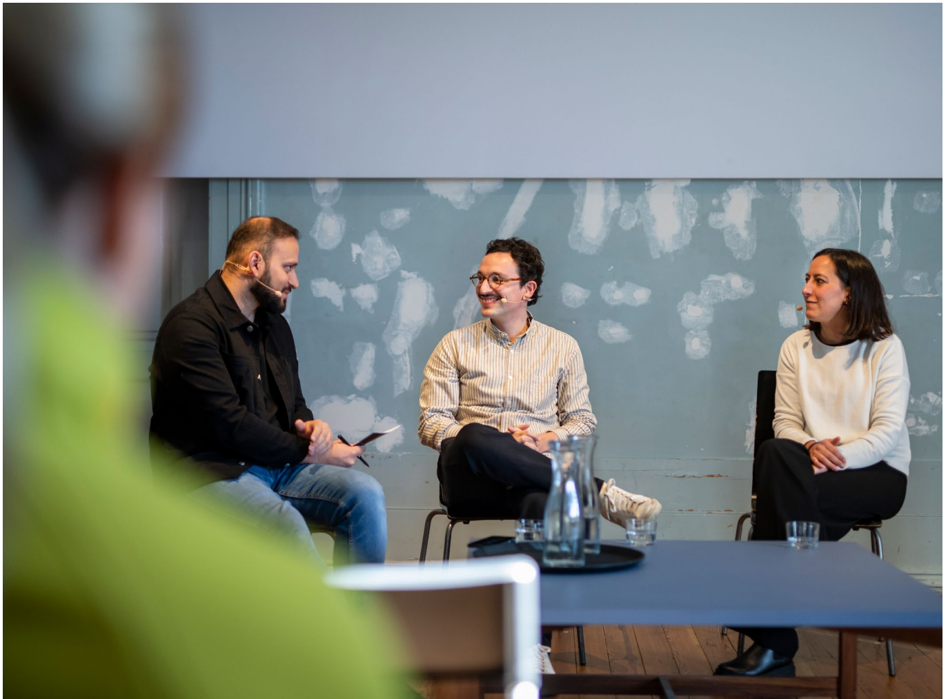
'Sustainability in Urban Planning' public debate