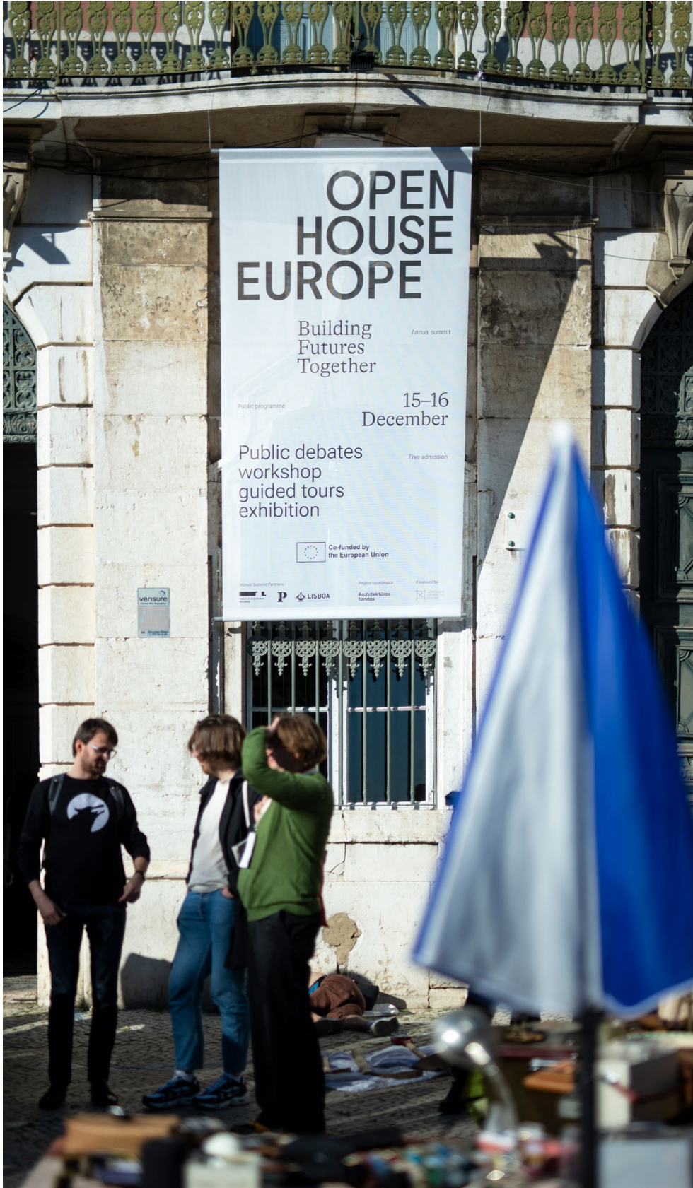
Annual Summit 2023.