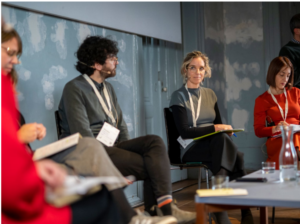
Public debate: 'Governance, Architecture and Sustainability'.