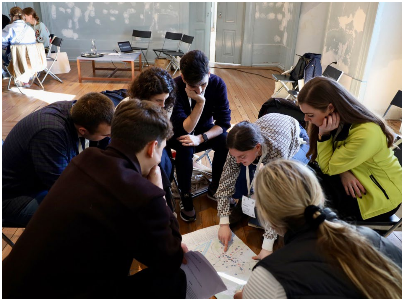
Annual reporting meeting and workshop. Day 1