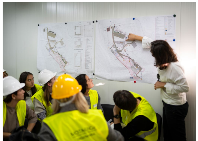
Guided Tour of the building site of the Lisbon Drainage Master Plan.