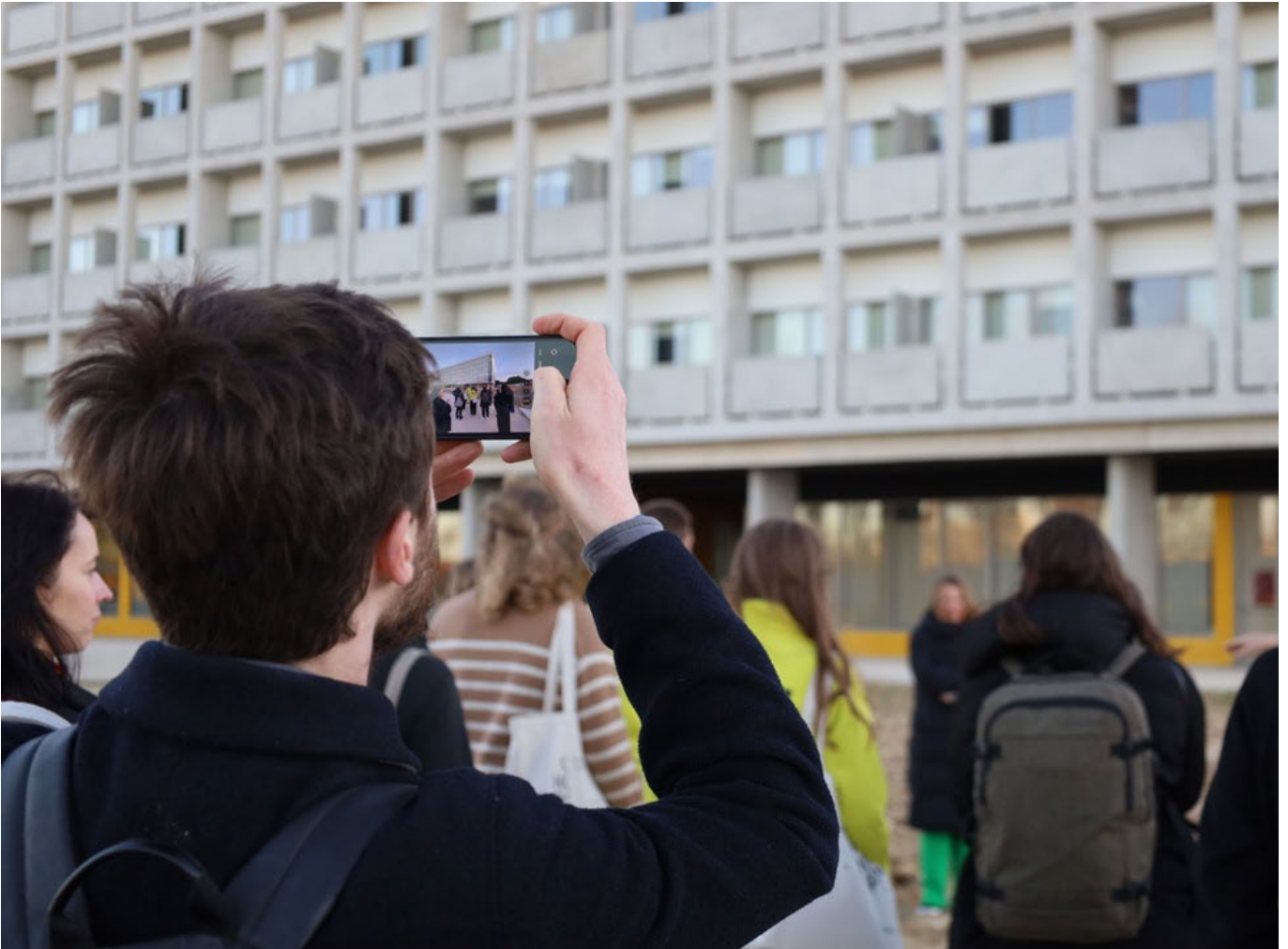
Guided tour of the student accommodation in Cidade Universitária.