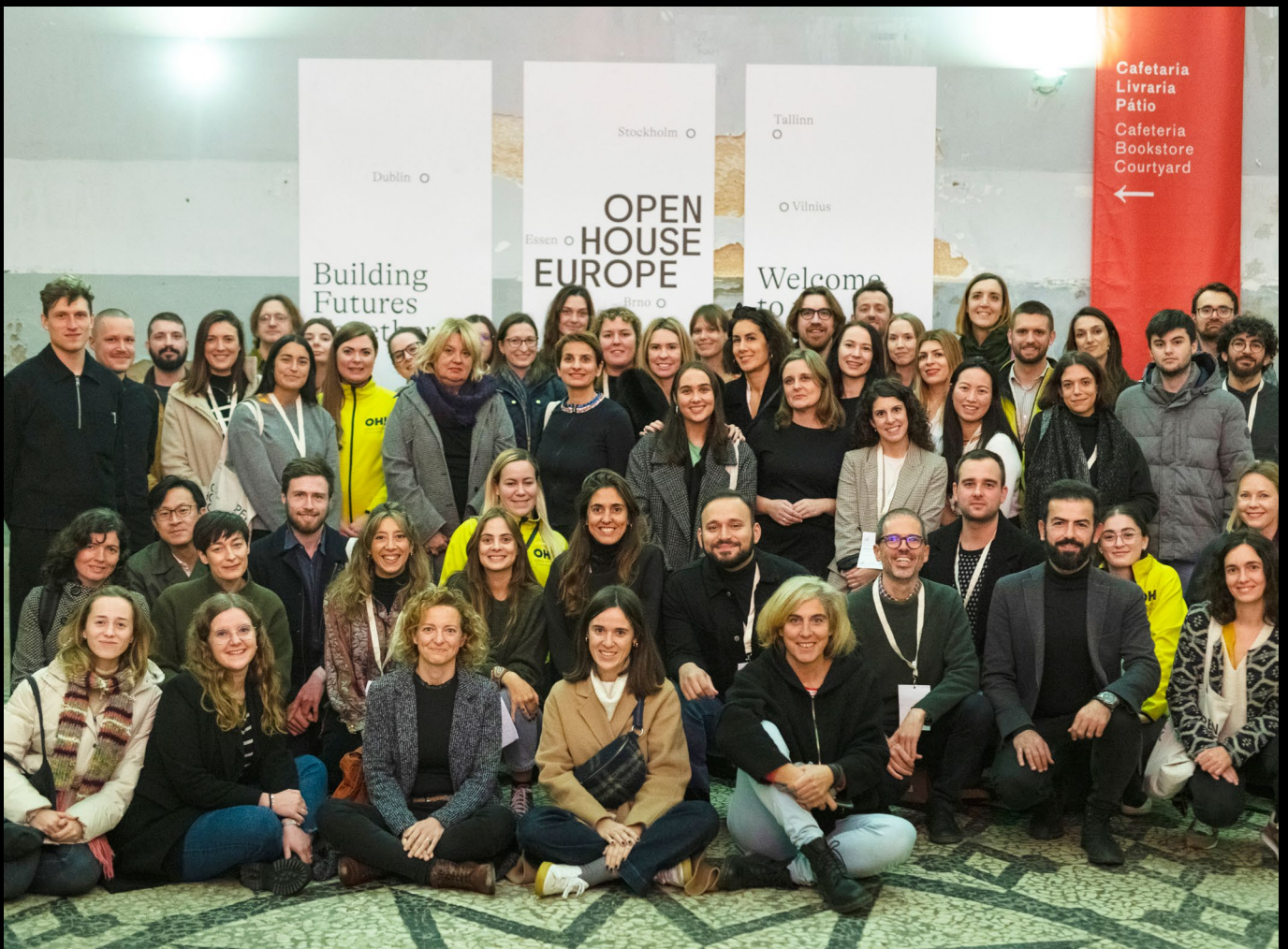
Open House Europe team picture.