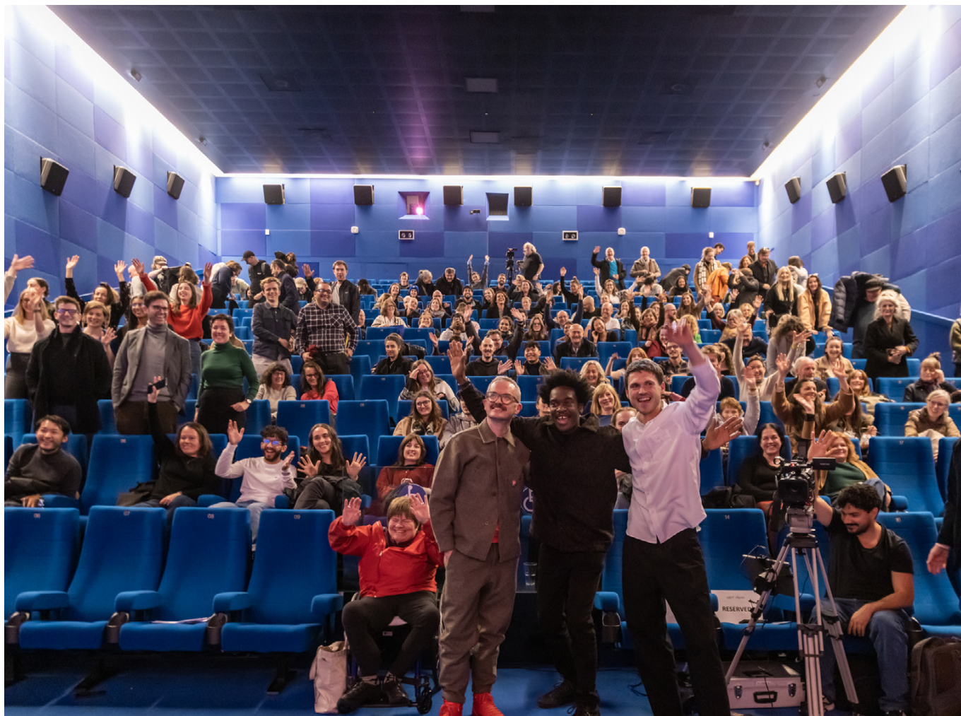
NewNowNext.

Cinema discount vouchers were provided to each volunteer, giving them access to discounted tickets and coffee. Each volunteer was given an invitation to private tours of two buildings specifically created for friends of the Irish Architecture Foundation. This was to encourage them to get more involved in the organisation throughout the year. During the festival, they were also provided with a special wristband that allowed them priority access to events and tours when off duty.