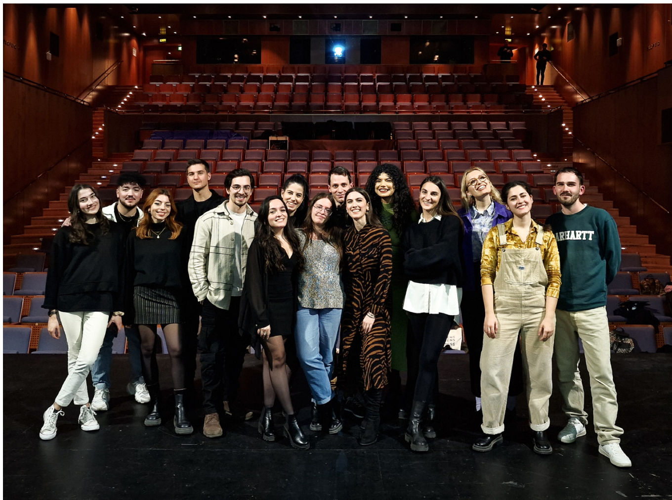
Coordinators of the Open House Athens 2023.