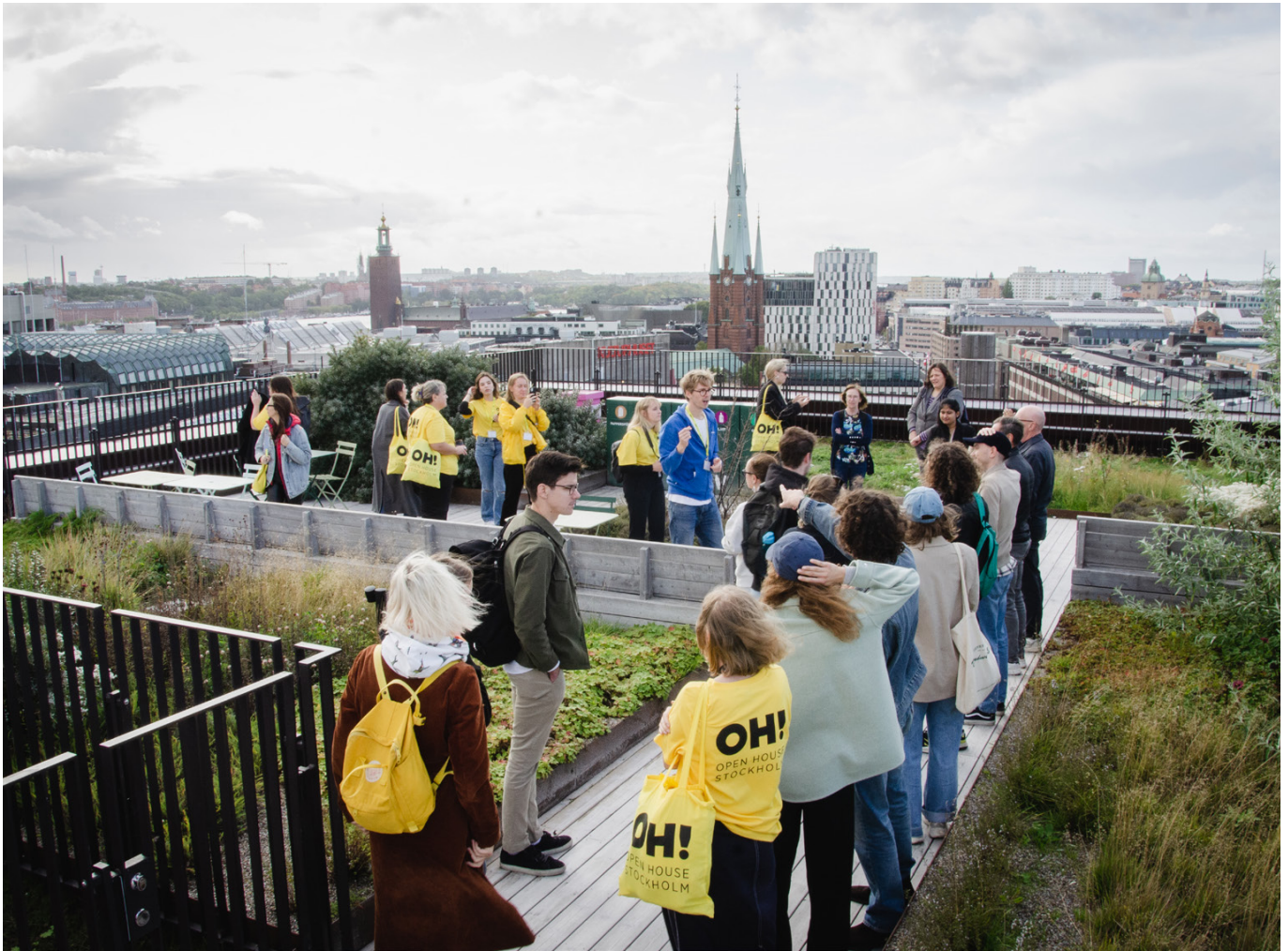
Open House Stockholm 2023.