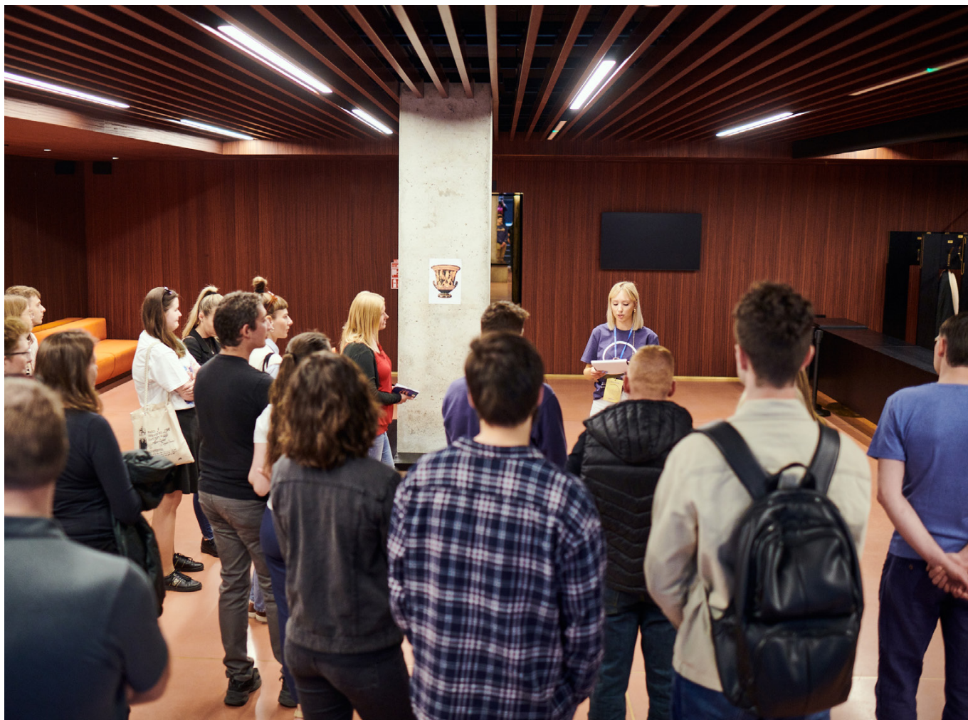
Excursion in Lithuanian National Drama Theater.

A few weeks before the event, trial excursions took place, offering the OHV community to participate in a pre-event and learn from each other. Each building had to organise at least two trial excursions so the team of volunteers could try to run the excursion and check if everything was okay with the route, information, timing and so on. All volunteers from other buildings were free to attend and learn good practices, share feedback and get information about the building.