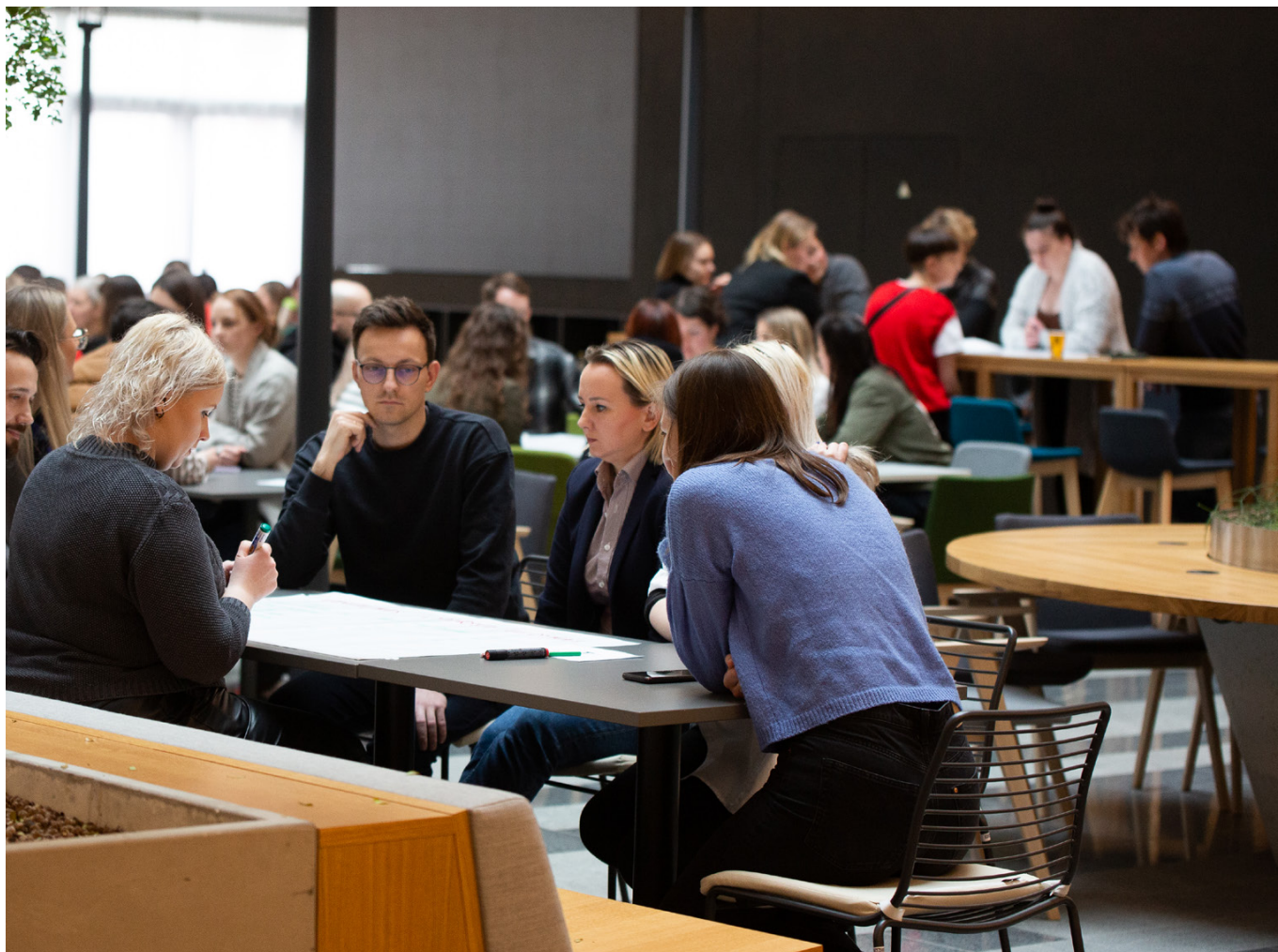
Training of mentors.

Approximate number of attendees: 60 mentors + 30 OHV organisers and coordinators