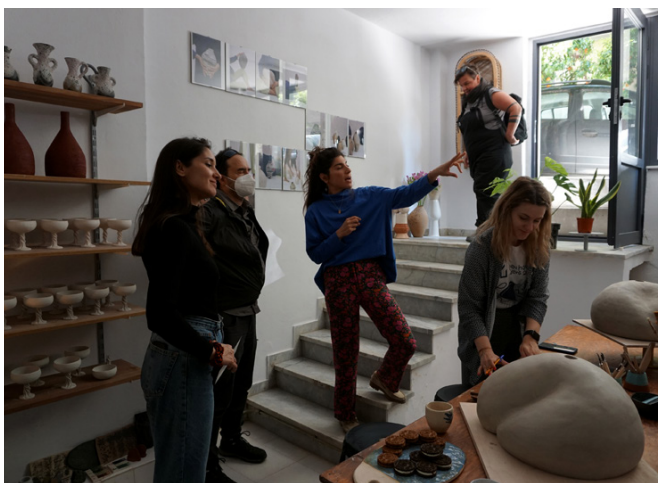
Anna Karountzou Ceramics.