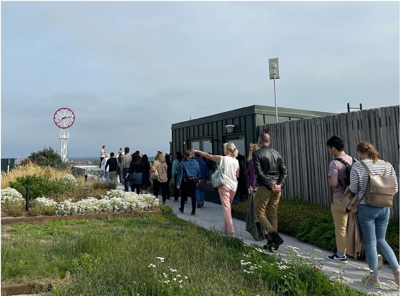
SFX study visit.

In its ongoing commitment to fostering inclusivity and diversity, Open House Stockholm continued its collaboration with SFX (Swedish for newly arrived professionals). These SFX students, with backgrounds in architecture and engineering, had the opportunity to explore Open House Stockholm and participate in study visits to Vasakronan's headquarters and Arena Sergel. The addition of study visits and physical information meetings for SFX is a new initiative this year and there are hopes to continue and expand on this in the coming years. SFX aims to provide these newly arrived, professionally trained individuals