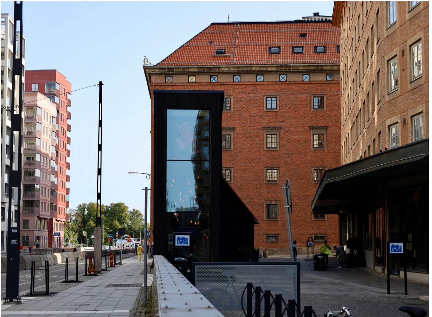
Restaurant Rummel.

This remarkable wooden pavilion captivates with its exciting form and modern expression, standing as a testament to sustainability. Spanning 375 m 2 at the intersection of