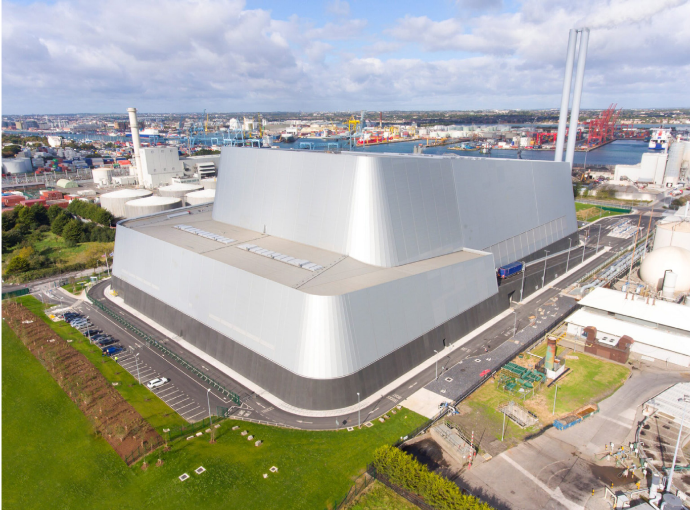
Covanta Plant

This building, which will become a gardening complex with rooms for storing plants to aid the maintenance of parks, was still in the early construction phase. It's planned to house a winter garden and storage space for ornamental plants brought in for the cold seasons. It will also contain a greenhouse where other exotic plants can be stored for use in parks during the summer.