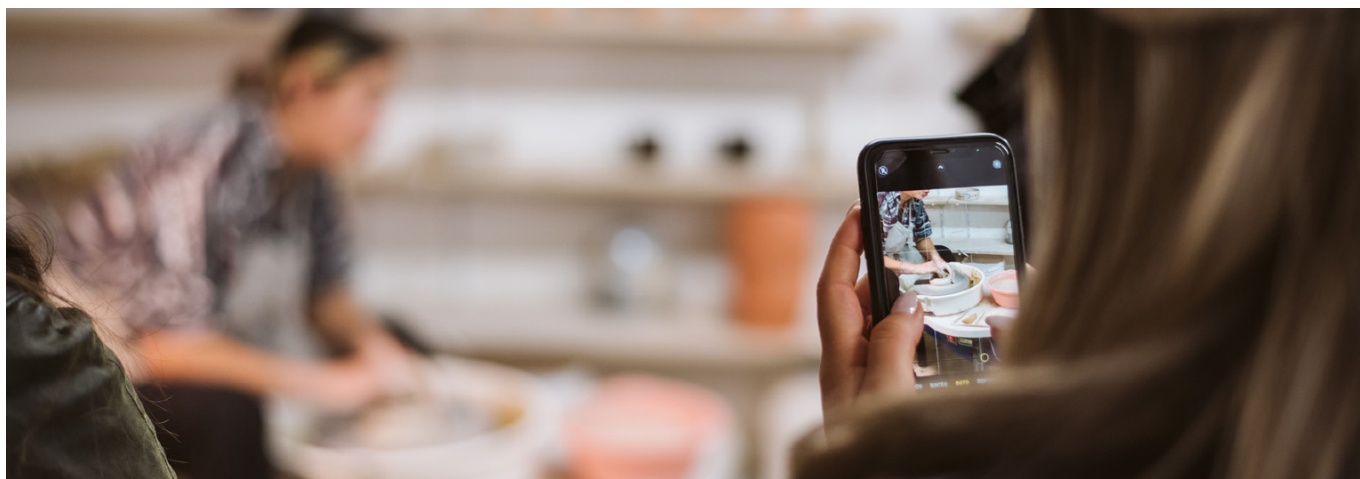
Made in Thessaloniki - Kota the studio.

MADE IN THESSALONIKI. This event comprised tours in creative and production spaces, highlighting the city's creative side while introducing the public to established and emerging creators and producers who are active in Thessaloniki and stand out for their work. The creators and producers led the tours themselves and visitors had the opportunity to see up close how they work using modern and traditional methods, explore the production spaces and understand the production processes. In this year's programme, 31 venues were included and 9 of them used sustainable methods and eco-friendly/recycled