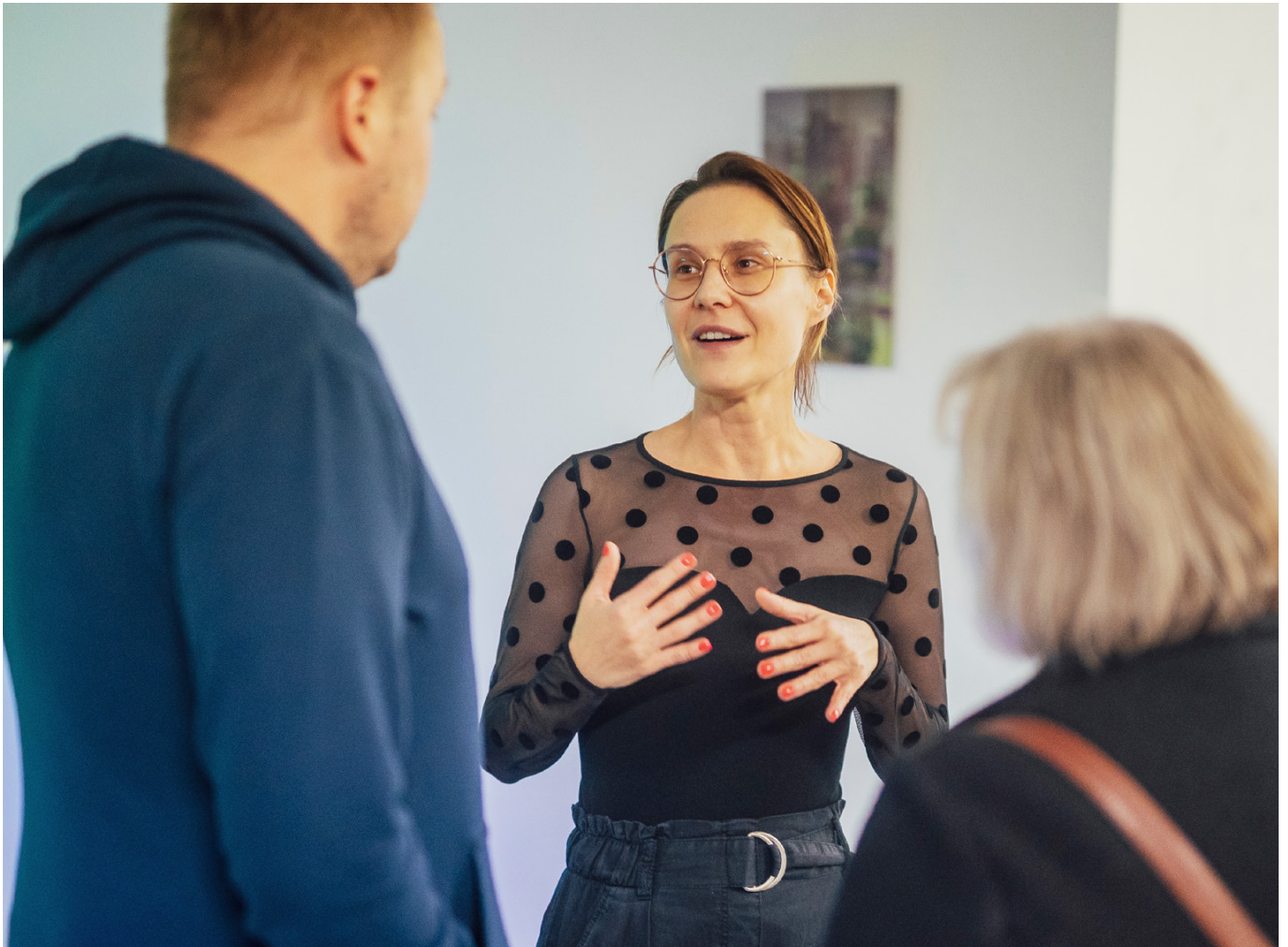
Open House Essen 2023.