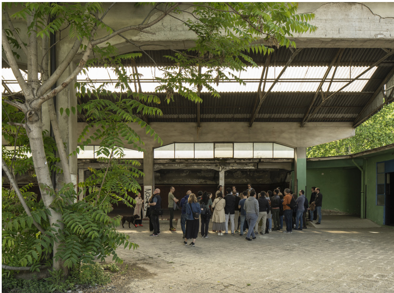
ARIA: Ex Macello.

ARIA is the winning project of the 'Reinventing Cities' international competition at the disused site of Ex Macello. ARIA will be the first carbon-negative district in Milan and the most important project for social housing in Italy. The project contract has been signed and the district will be developed by Onøhetta Oslo AS, Barreca & La Varra, CZA—Cino Zucchi Architects, Stantec and Fondazione Housing Sociale. The building was chosen for OHM because it is still a construction site and offered the opportunity to show what is going to happen in this area of the city. All the visits have been guided by some of the involved architects (Barreca & Lavarra and Fondazione Housing Sociale).