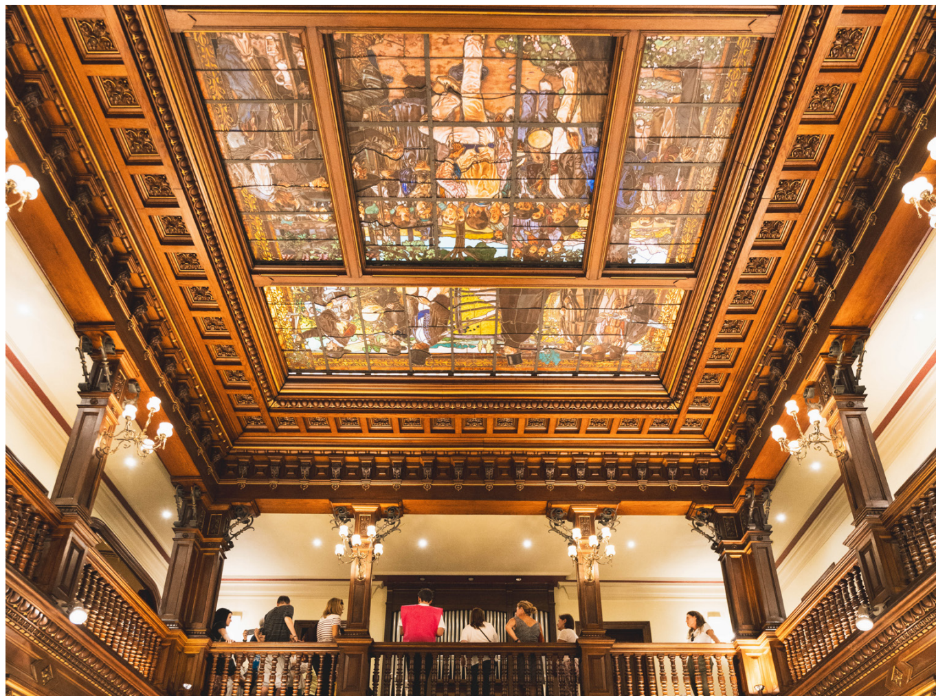
Open House Bilbao 2023.

Open House Bilbao 2023 had 1 guided tour for English speakers and 1 for Basque speakers.