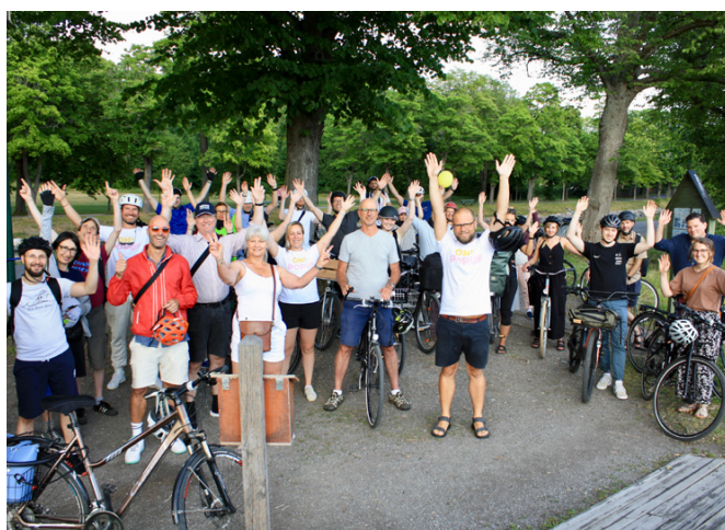
Guided bike tour of Djurgården.