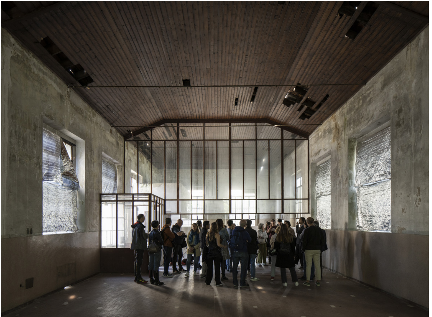
ARIA: Ex Macello.

An exclusive guided tour, held by the architects of Barreca & Lavarra, dedicated to the volunteers who couldn't see the project during the festival weekend.