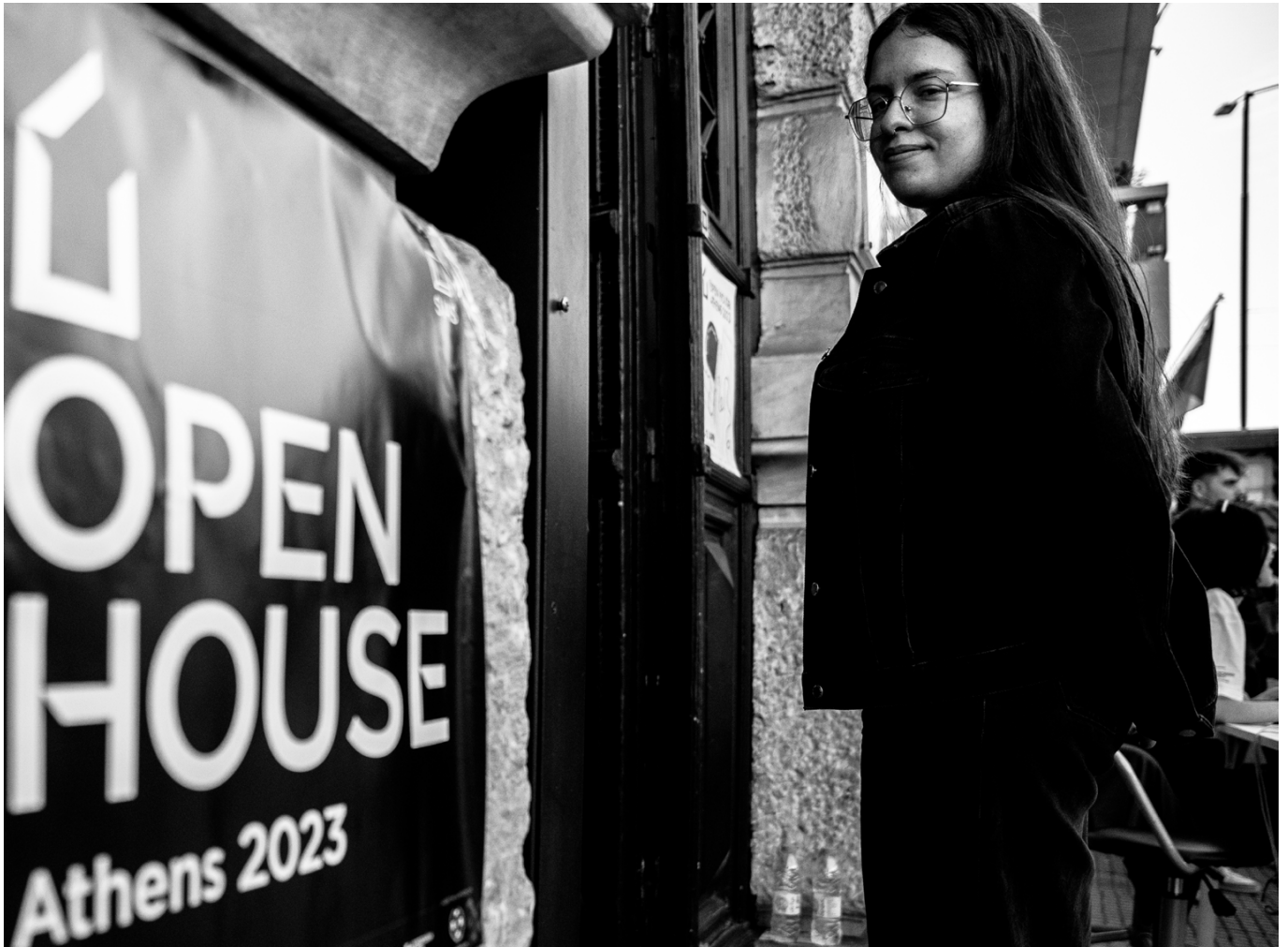
Architectural office on Vasilissis Sofias av.

Open House Athens took place between April 1–2, with the established architectural tours of 60+ buildings and 2 routes in the centre of Athens and Kifissia, where 450 volunteers led tours for thousands of visitors.