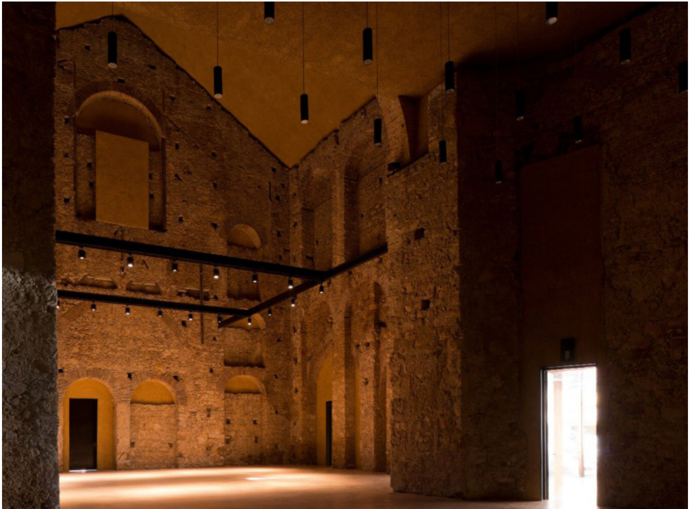
Teatro Thalia.

Built by the Count of Farrobo in the Quinta das Laranjeiras area, now the Zoological Garden, Teatro Thalia shares features with Teatro D. Maria II, in particular resemblances on the façade. The original building burnt down in 1862 and was only restored 150 years later, in a gesture that is as delicate as it is hard, engraving in the material the traces of the passage of time, destruction and reconstruction. Perhaps ironically but not naïvely, the inscription on the frieze reads 'hic mores hominum castigantur' (Eng. here, the customs of men shall be punished). The ruined walls served as lost formwork for the application of concrete. The interior remained intact, and the volumes of the stalls and stage area were reconstructed. The remaining functions and infrastructures, organised in two bodies, close the patio and open a new front to Estrada das Laranjeiras. The materiality of the project contrasts the concrete pigment with the colour of the glass panels.