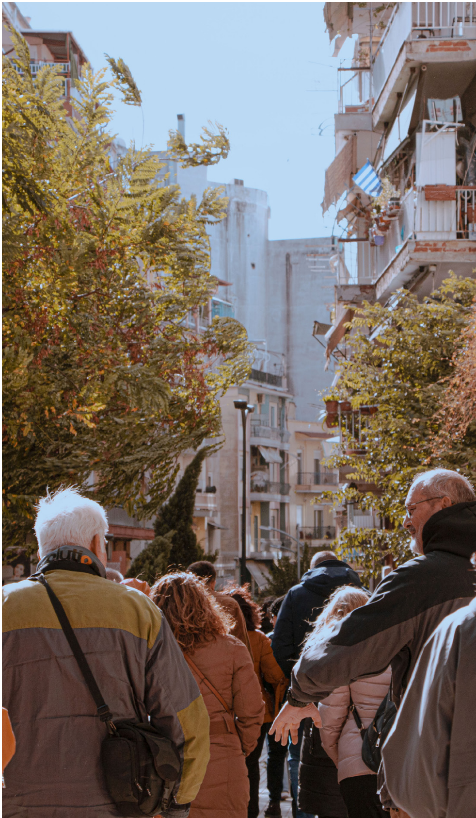
OPEN WALK - Western Walls.