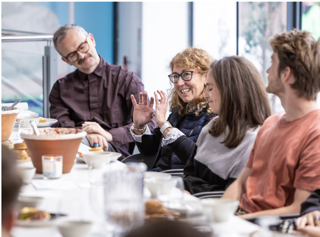
Open Table: Housing and the City.

As part of Open House Dublin, the Irish Architecture Foundation presented a series of lunchtime conversations and speculations on Dublin as an inclusive and 'open city'. At each conversation, a host and festival guests gathered around a table to eat together and discuss topics such as ageing, activism, housing and sports in the city. Strangers before the talk became equals at the table, and the 'Open Table' conversations celebrate the