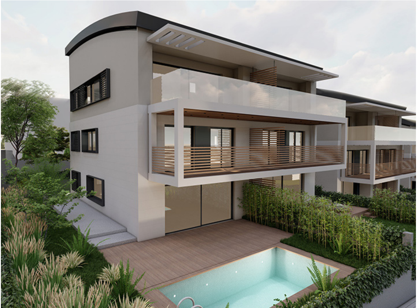
Three Green Curves.

This residential complex in Thessaloniki consists of three identical buildings in which there are a total of six maisonettes and six apartments. For the design of the houses, the basic principles of bioclimatic design were followed to create sustainable houses that can achieve the minimum amount of energy consumption. The complex follows the natural slope of the land, taking advantage of the plot's orientation and view, occupying an important corner of the building block and leaving the south-east boundary free for the creation of the necessary accesses.