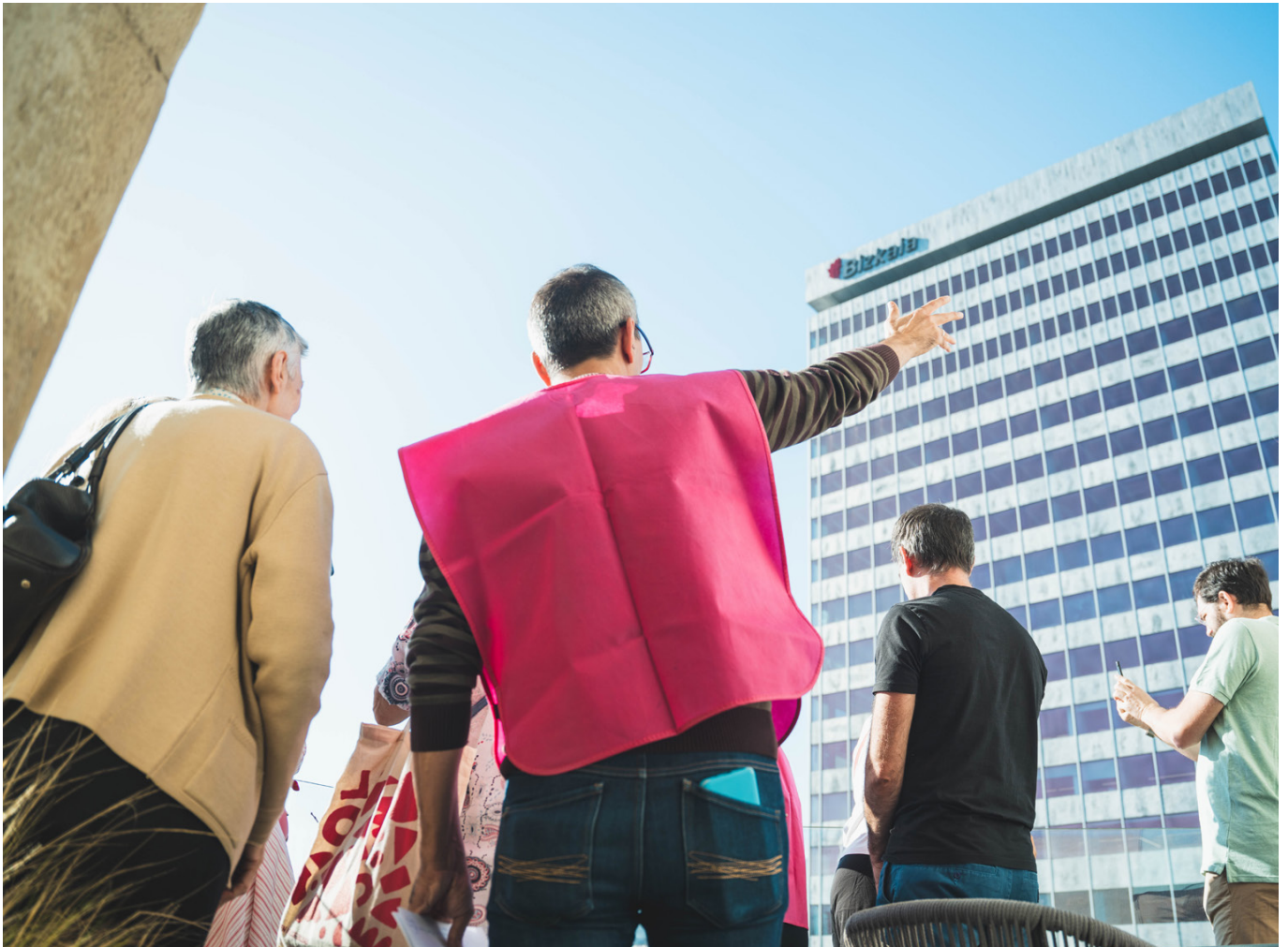
Open House Bilbao 2023.

Approximately 20 days before the festival, volunteers made a pre-visit to the building where they would be volunteering on the days of the event. This was a trial visit in which volunteers were guided by an expert and got to know the building firsthand. 66 pre-visits were made, one for each building that opened its doors during the festival.