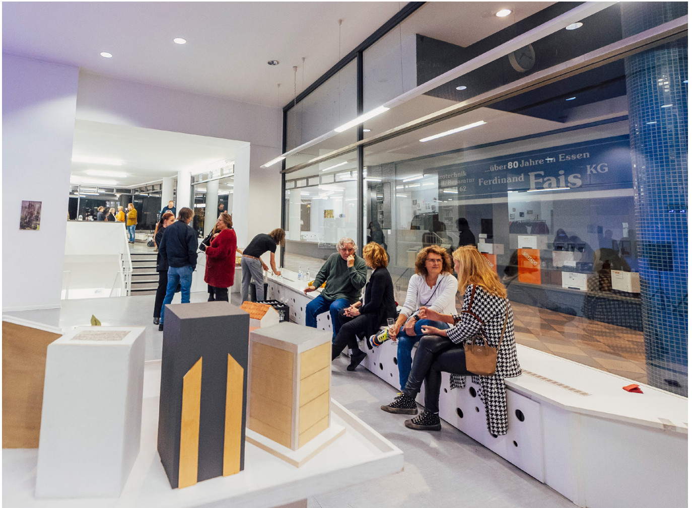
Volunteers' party.

The party was planned as a networking get-together, with music and catering, where festival volunteers, partners and organisers shared their experiences, thoughts and feedback, while also making contacts for