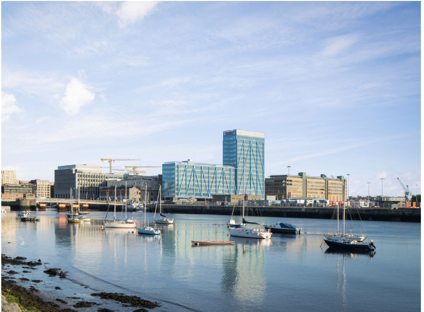
EXO Building © Courtesy of the Irish Architecture Foundation

The landmark EXO building is the tallest commercial office building in Ireland. A unique engineering challenge, the building features a distinctive and highly innovative exoskeleton which forms the main structure, leaving a column-free floor plate at the perimeter and referencing the iconic blue gantries of the Dublin Docklands. The building features an extensive 1000 m 2 landscaped roof garden to which all tenants have access. Its pristine form responds to its unique location adjacent to the