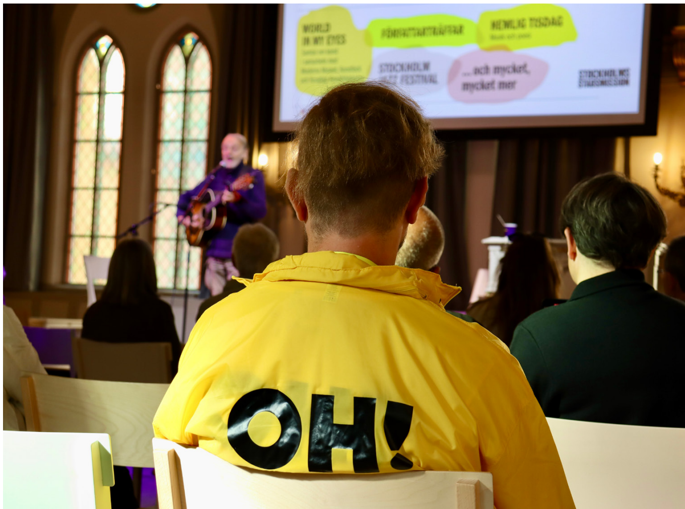
Open House Stockholm 2023.

Before and after the festival, team-building events were organised with the project team and area coordinators. Prior to the festival, they delved deeper into their responsibilities and roles during the event and played some games