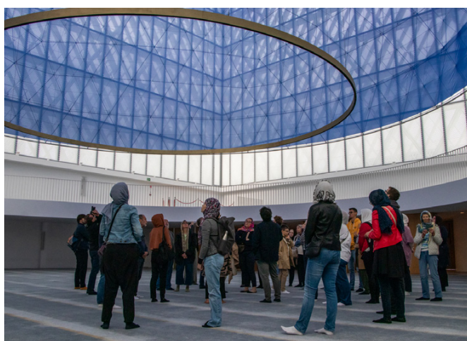
Muslim center.

The programme of this three-day, architecture 'minifest' aimed to raise awareness among local residents and the general public about the importance of well-designed spaces for quality of life and ensure greater accessibility to quality architecture throughout the year. During the minifest, the OHEu annual theme was connected with important public projects in Ljubljana that are crucial to the city's