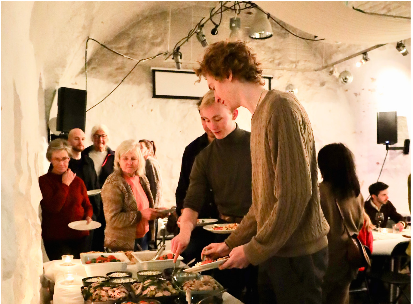
Thank-you event.

The annual thank-you event for OHS volunteers served as a heartfelt expression of gratitude and a means to foster unity within the group. The idea of this event stemmed from the recognition that the festival's volunteers are vital to its success. Organisers aimed to create a dedicated space to acknowledge volunteers' contributions and build a sense of community. The event featured a city walk in the spirit of Open House, followed by a gathering with