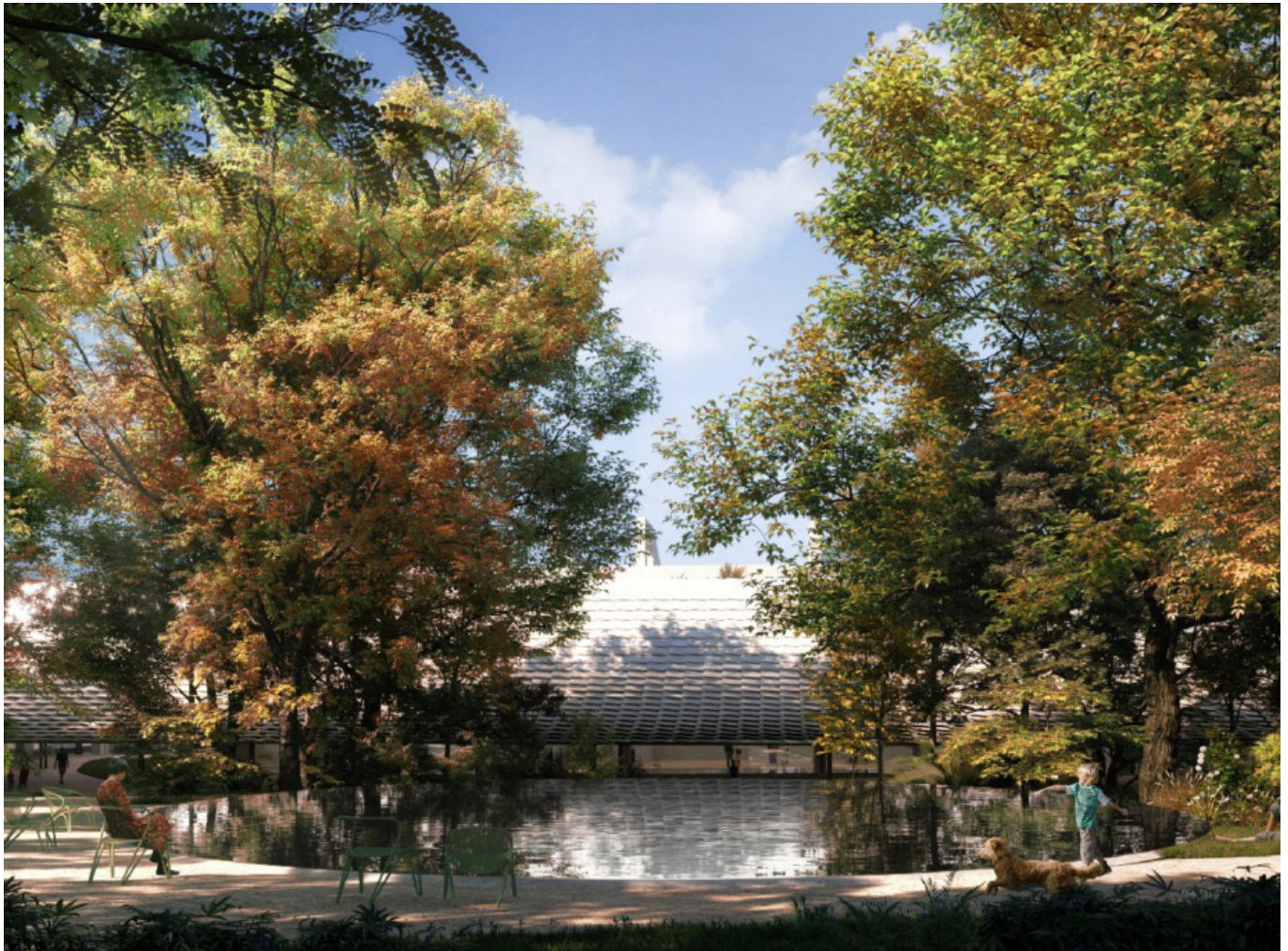
CAM and the Gulbenkian Garden Extension.

This project by Japanese architect Kengo Kuma is still under construction and it was one of the most coveted spaces to visit. For security reasons, it was only possible to offer the public four tours for 20 people each.