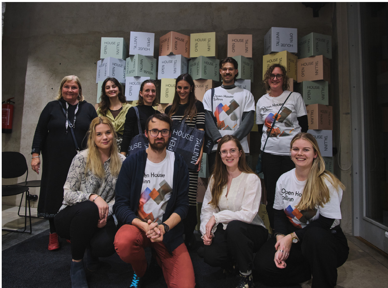
Thank you event .

In addition to the previously mentioned diverse activities that support the personal development of volunteers, OHT provided a motivational package comprising a well-made t-shirt, a notebook, a uni PIN pen, a tote bag and a yardstick. There were also prizes from the festival's partners and sponsors that could