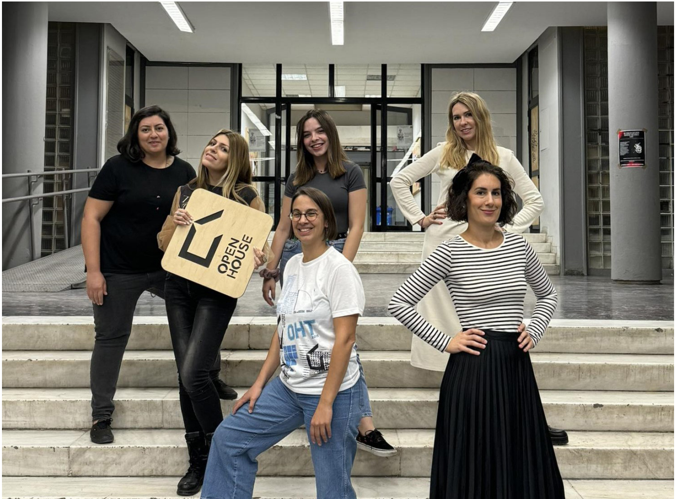
Open House Thessaloniki organisers.

In total, Open House Thessaloniki 2023 attracted 9495 attendees: 3707 men, 5758 women, 29 non-binary people.