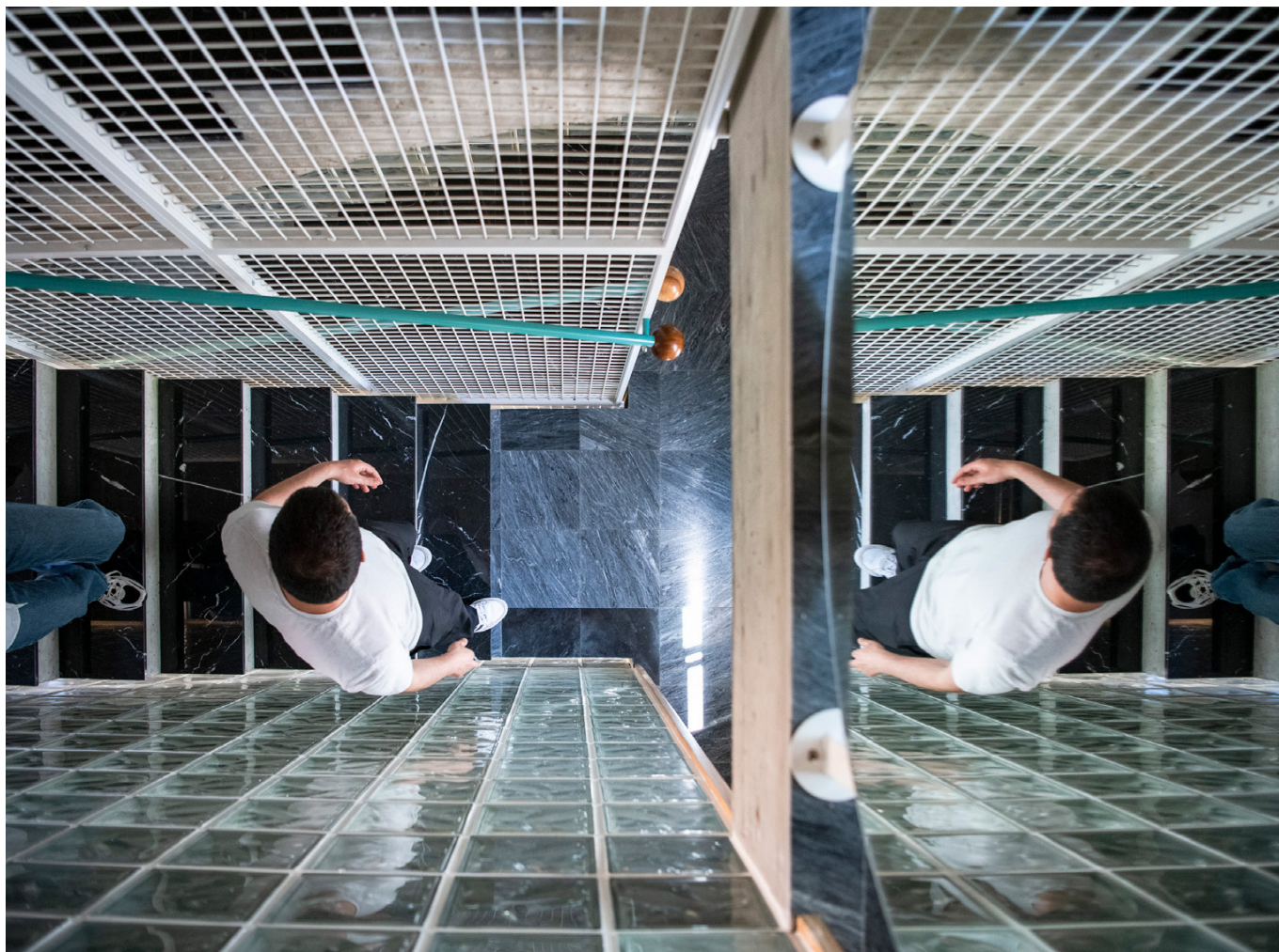
Open House Lisbon 2023.

Open House Lisbon 2023 had 19 guided tours for English speakers that attracted 360 attendees.