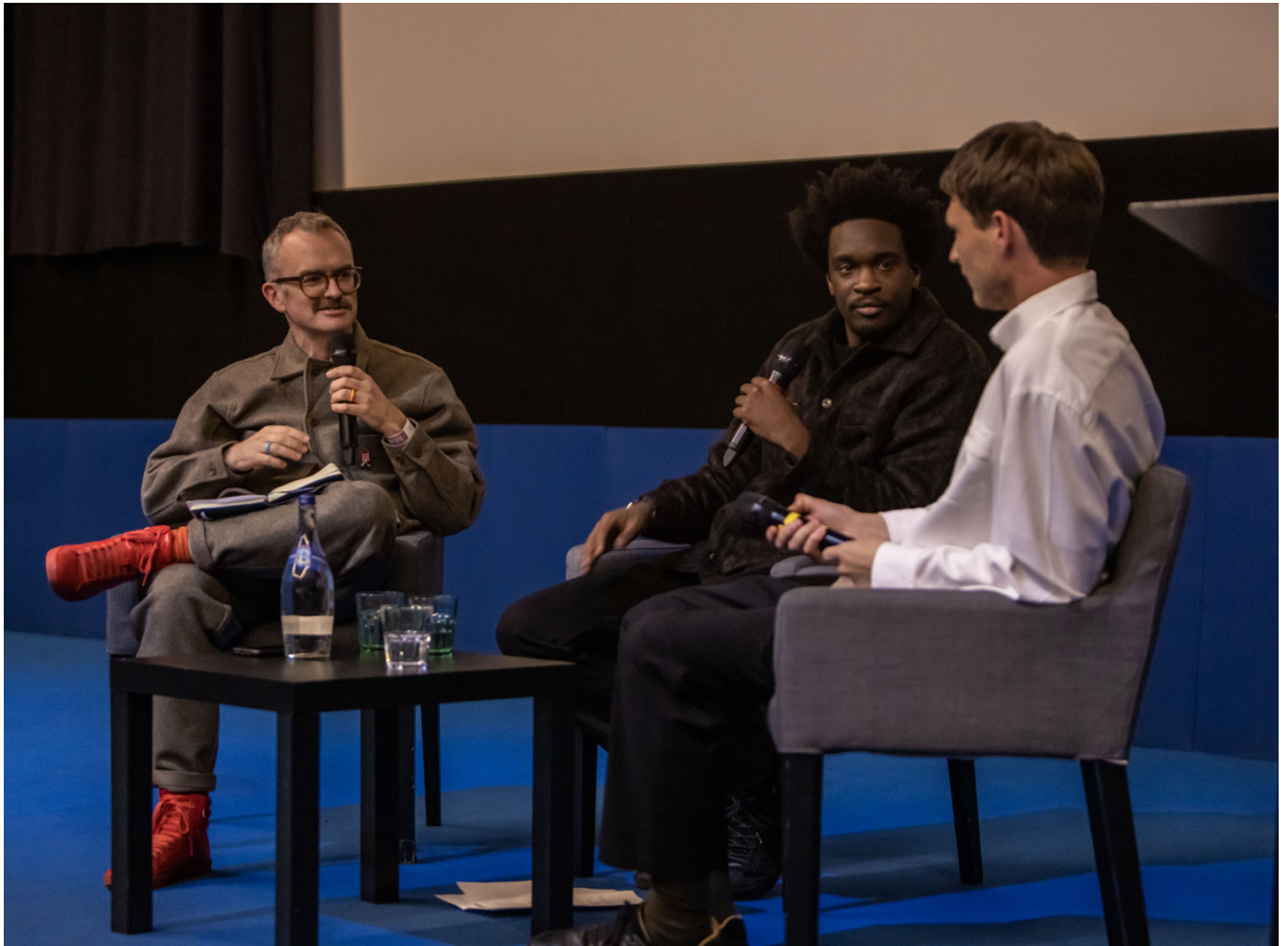
NewNowNext.

Presented by the Irish Architecture Foundation, NewNowNext is a season of live talks disseminating new ideas and ways of acting in architecture that are relevant to the world today and the society of the future. In October 2023, Open House Dublin hosted a special NewNowNext event entitled 'Cities Have