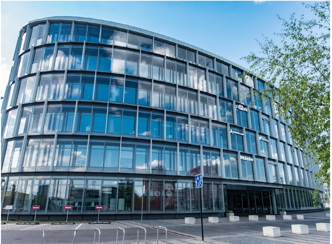
k29 Business Centre.

This office building on Konstitucijos Avenue has received the highest rating for harmony with the environment in the Baltic countries. The building has been awarded the 'Excellent' BREEAM In-Use certificate and was the first building with this type of certificate in the Baltic countries. The project also received all the main Lithuanian architecture and innovation awards: Archiforma, the best Real Estate project, Žvilgsnis į save (Eng. Look at yourself) and one by the Ministry of Environment. The building has been designed with the quality of staff work areas in mind, integrating new dual façade technology that protects against noise and contributes to maintaining optimal indoor temperatures.