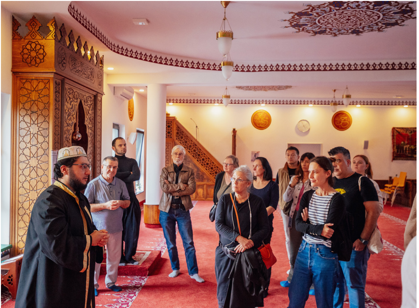
Open House Essen 2023.