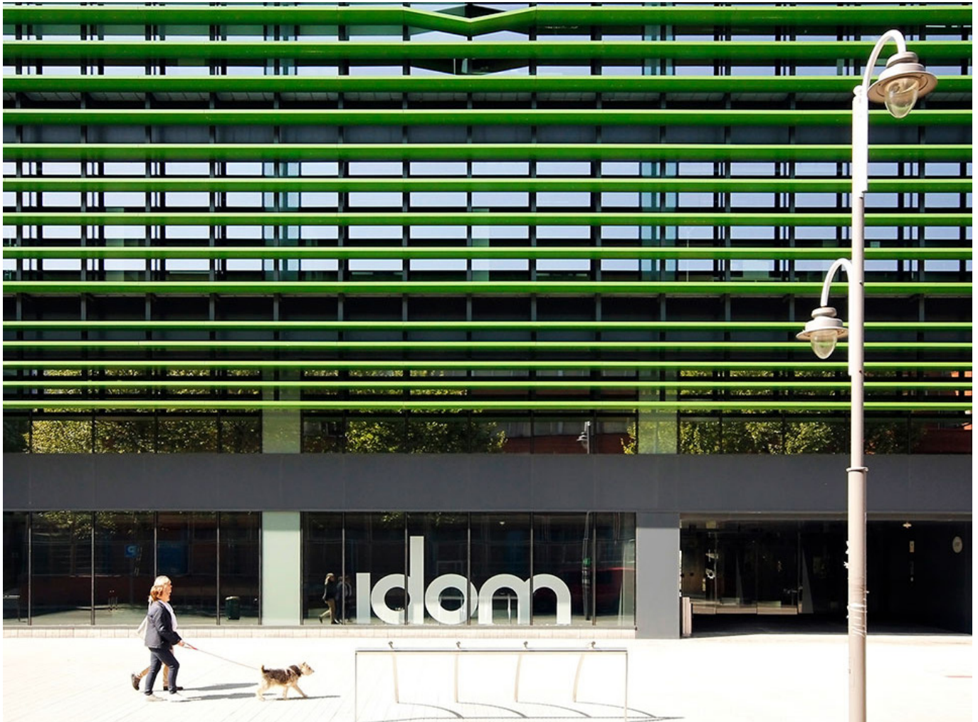
IDOM Headquarters

The building, located in a former port customs warehouse on the edge of the Deusto canal, is the new headquarters of the IDOM company. The refurbishment of this building is renowned for its ambitious energy efficiency. It has a surface area of 14400 m 2 dedicated to offices and research spaces. Some of the building's innovative energy efficiency measures include energy-efficient sanitary equipment in the bathrooms, rainwater storage for later use in the building itself, automatic regulation of lighting to save energy, photovoltaic panels, and water heating and cooling facilities. The green roof hides the air-conditioning equipment, becoming just another façade while acting as an element of noise and CO 2 absorption. Aesthetically, the uniqueness of the façade lies in its large solar protection slats, designed to increase the building's energy efficiency in summer which results in energy savings of 60%.