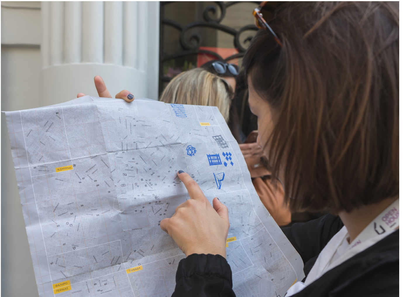
Open House Athens 2023.

OPEN your map. This competition invited visitors to create a special souvenir from Open House Athens 2023, their personal map, by collecting stamps from the buildings they visited. Visitors could obtain a printed map and, after completing their visits to the