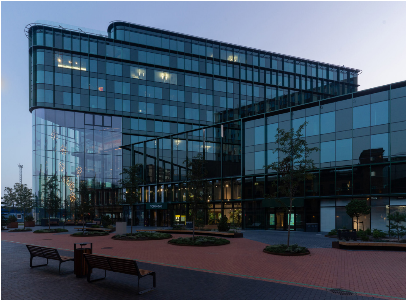
Alma Tominga Building. Photo by Evert Palmets © Courtesy of Eesti Arhitektuurikeskus MTÜ

The architectural design, inspired by user-centric and user-friendly principles, emerged from an international open call, won by the PLUSS architectural firm. The 11-storey Alma Tominga office building has been awarded the LEED Gold certification for energy and environmental sustainability, and solar panels have been installed here. The building is designed to be versatile, allowing it to be transformed into a hotel or apartment building by changing room layouts as needed. The building utilises green energy and benefits from the Utilitas district heating and cooling system installed last year. It houses office spaces, a car showroom, a clinic and a restaurant. The most eye-catching elements of the building include a 21-metre-high glass atrium and a tropical climate palm garden located next to the main entrance.