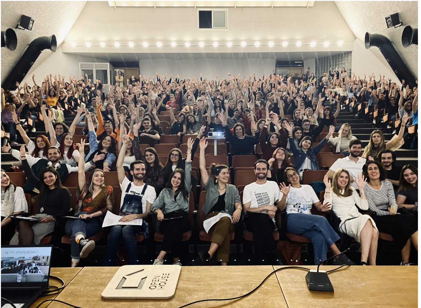
Volunteers meeting

Two days before the main event, we organised a gathering outside our info point to distribute the T-shirts and other required materials. A radio station, which was OHT's media sponsor, played music while organisers and volunteers enjoyed food and drinks.