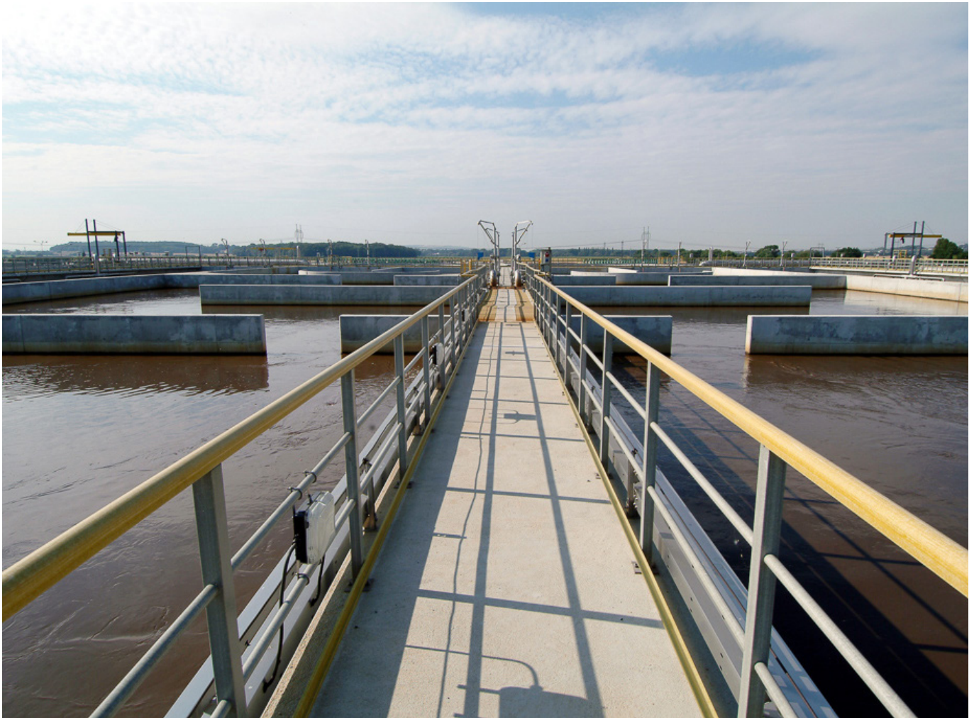
Wastewater treatment plant.

This facility purifies wastewater not only from the city of Brno but also from adjacent towns and municipalities. It was built on the Modřice cadastre in 1961 to replace the original wastewater treatment plant in Pisárky from 1871, which was no longer sufficient for the Moravian metropolis in the post-war period. The original two-stage wastewater treatment plant with anaerobic stabilisation of sludge was reconstructed at the turn of the millennium into a mechanical-biological wastewater treatment plant, which also includes sludge and energy management in the form of a biogas station generating heat and electricity. Between 2009–2010, the operation of the activation tanks was