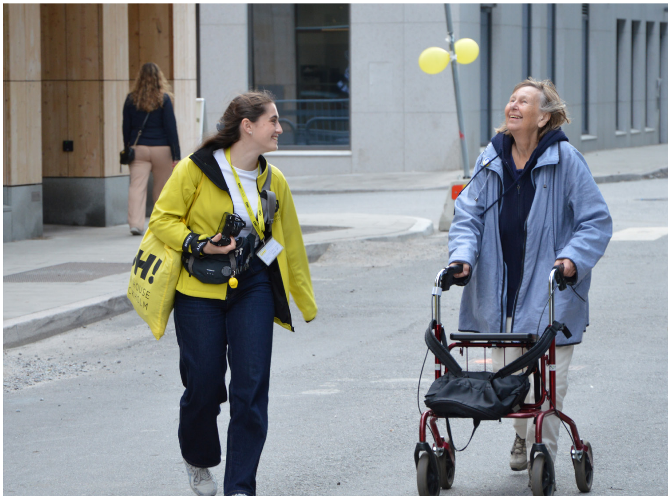
Open House Stockholm 2023.

Open House Stockholm 2023 had 17 guided tours in English and 5 open houses with English-speaking hosts.