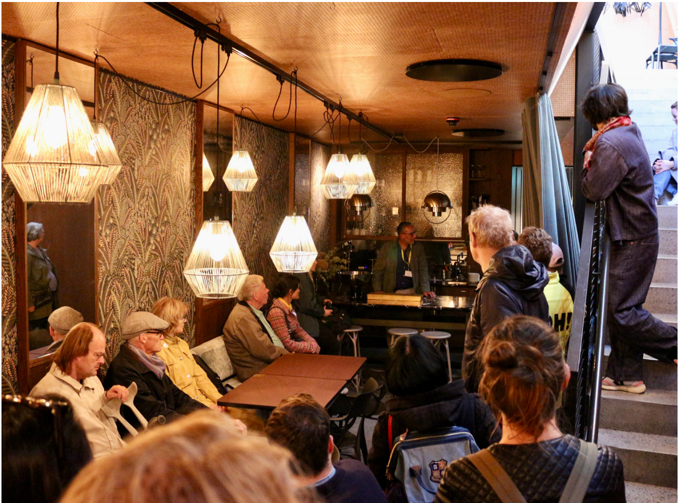
Restaurant Rummel.

Its floating wooden structure, featuring tall glue-laminated timber columns and beams, sets an environmentally friendly tone. The use of cork-clad walls not only contributes to a warm ambience and good acoustics but also underscores a commitment to sustainable materials.