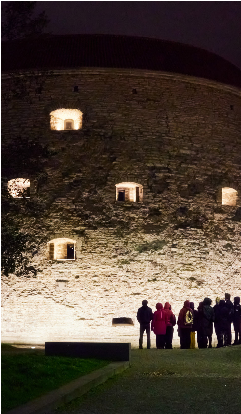
Lighting design tour