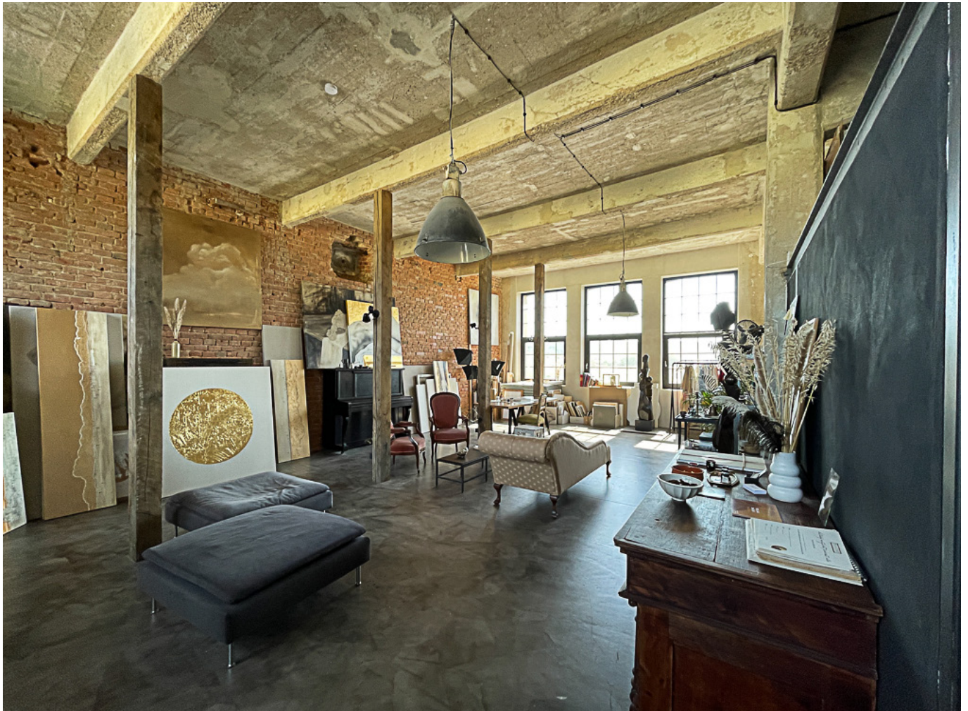
DADA Distrikt.

This former textile factory on the Svitavský embankment was renovated into an eye-catching combination of loft housing, studios, open plan offices and a sustainable roof garden designed by architects from DADA Distrikt, Kogga, GreenVille, Acer Woodway, Partero and U1.