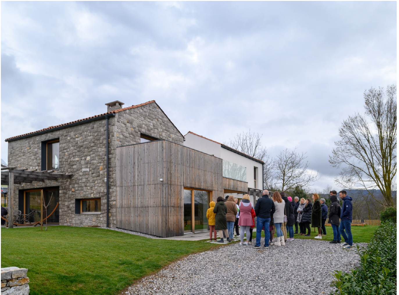
Open House Slovenia 2023.