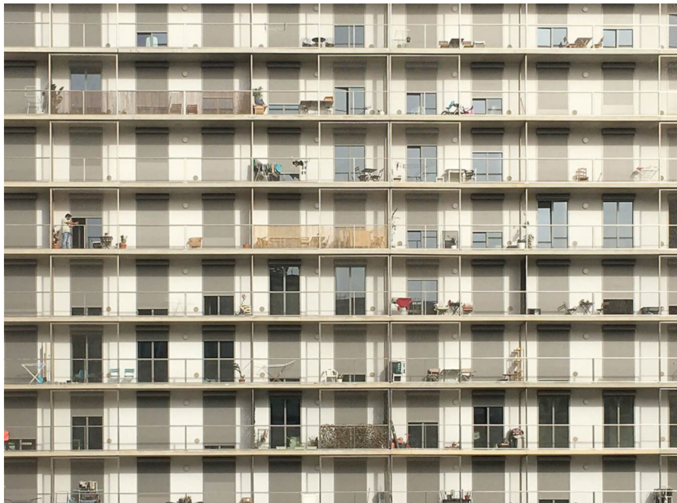
Affordable Housing at Avenida das Forças Armadas.

During the weekend of OHL, 18 guided tours of this project attracted 241 attendees. This major intervention for five housing blocks and a parking lot on Avenida das Forças Armadas, part of the Operação Integrada em Entrecampos, was launched in 2018 by the Lisbon City Council. Defined around a public garden, it continues the Lisbon Public Urbanization Company's (EPUL)' surrounding constructions from 2005 to allow a pedestrian connection to the university campus through garden areas. The construction of new housing at controlled costs promotes sustainability, governed by principles of functionality and the economy of means, developing optimised forms of spatial, structural and infrastructural design. The pilot building served as a trial for the implementation of these methodologies and is already inhabited. Two other lots have been completed and the last one is under construction, with a total operation of 45,000 m 2 of housing.