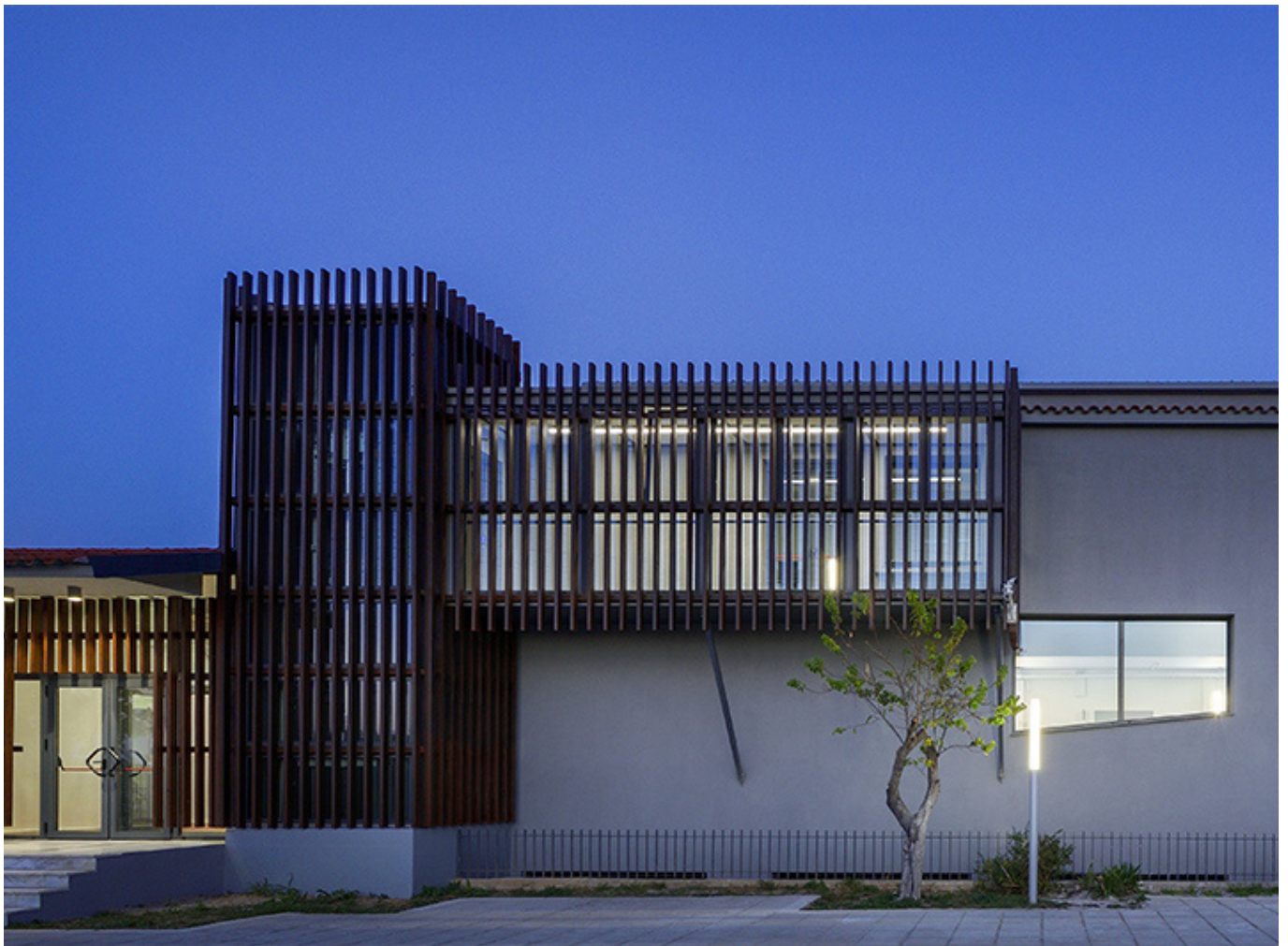
West Hall, American College of Thessaloniki.

The former primary school of Rigas Feraios is being refurbished to accommodate the American College of Thessaloniki (ACT). The complete renovation and energy upgrade of the building and its surroundings translates into their complete functional, constructional and morphological modernisation to function as a modern and sustainable educational building meeting the ACT's requirements.