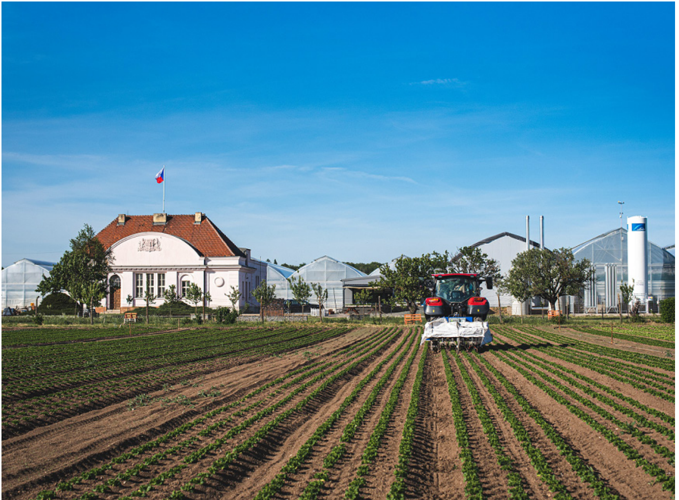
Farma Ráječek.

This former radio broadcasting station was recently converted into a farm. Strawberries can be grown, like tomatoes, hydroponically. This means that 80% less water is needed to grow them than using field cultivation. All the water and nutrients the plants do not accept are recycled in a closed system, which saves resources and keeps substances out of the environment. As in life, a complete compromise does not work with strawberries so while it's not possible to have strawberries reach giant sizes and deep red colours, nevertheless, the local taste remains. To address problems such as diseases and pests, biological protection is used to protect the plants based on natural principles. For example, insect predators are used to feed on strawberry pests and mould is prevented by creating the ideal climate for plants.