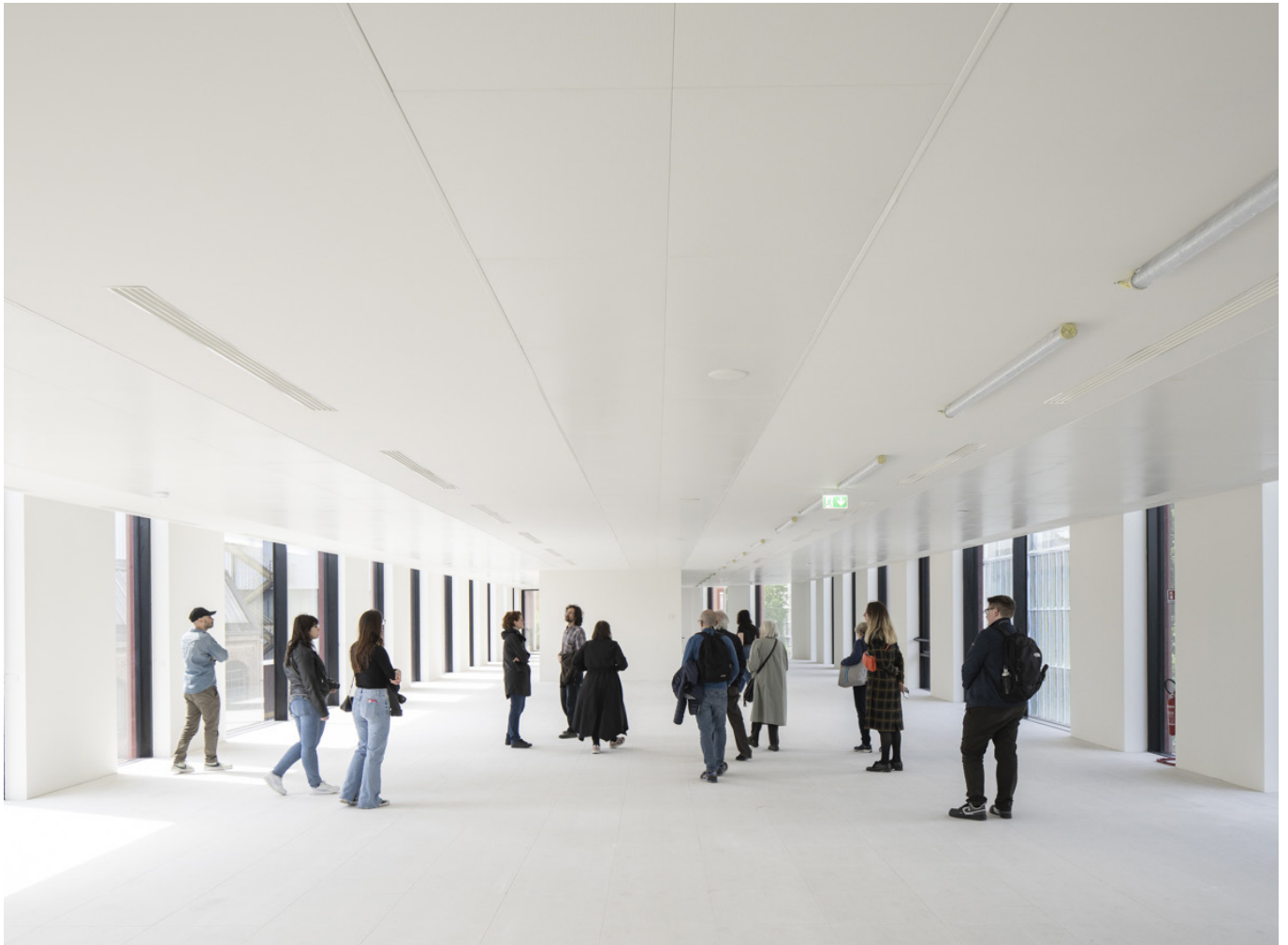
Bicocca 336.

The new office building in Viale Sarca is a contemporary version of local architectural archetypes, managing to remain in continuity with the development of the surrounding Bicocca district, the colours of which the building has absorbed in the façade structure; the very design of the façade summarises and interprets the morphological elements of the surrounding buildings. The building shows attention to the environment and the surrounding landscape through the exaltation of differences and the encouragement of a spatial design philosophy increasingly open to hybridization. The mostly open-space offices become large, shared spaces through balconies and large openings to the outside that offer telescopic views for their occupants. Open 336, created by Park Associati, is a LEED Platinum Building, with net carbon zero emissions.