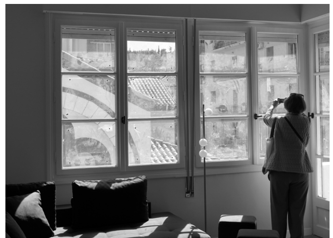
Open House Athens 2023.

MADE IN ATHENS. This event took place at various production areas of Athens, in order to highlight the creative community of the city, introducing artists, designers and all kinds of producers and creative minds. The creators and producers showed the way they work, using modern and traditional methods. Some of the designers showcased working using sustainable materials and methods.