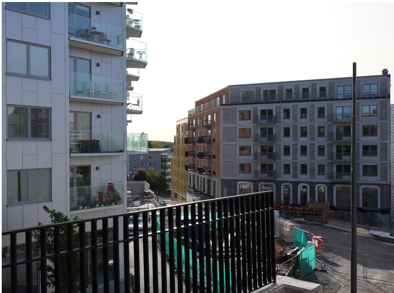
Central Nacka.

In Nacka's most central location, the dynamic intersection of nature's tranquillity and the city's heartbeat is characterised by the design and content. In the newly crafted urban environment, a harmonious blend of sustainable quarters, streets and squares emerged.