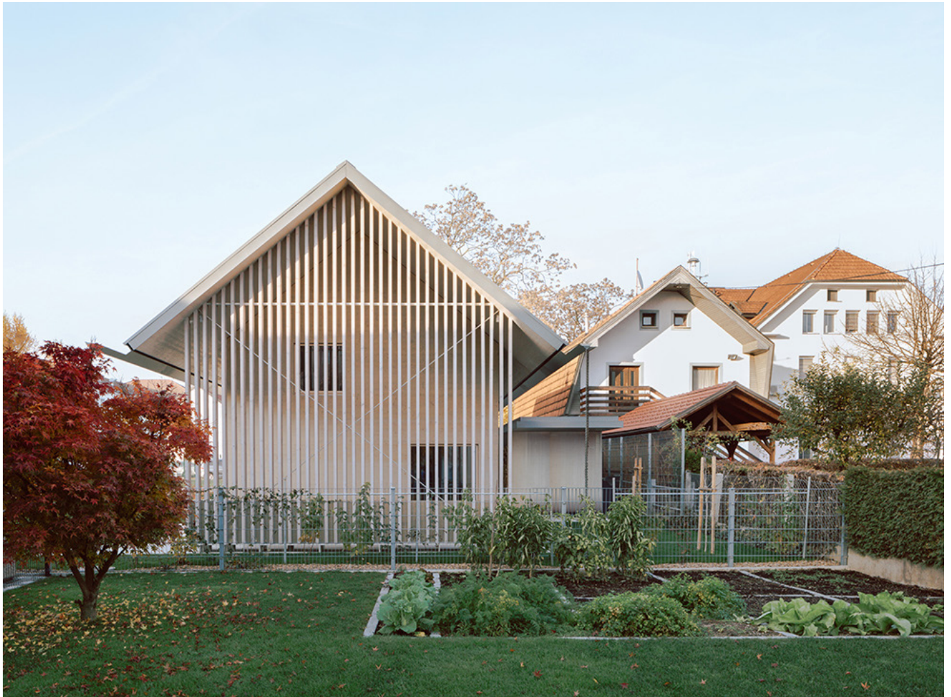
House MM.

This house in the centre of a small town near Ljubljana was one of the few, well-preserved typical houses in the neighbourhood, serving as an example of the first and third categories of buildings. The conservation of cultural heritage is crucial to preserving a building's spatial qualities—its space-time, multilayered built tissue and the identity of the environment. The designers working on House MM hope the building can represent an alternative, financially viable and sustainable approach to home renovation. They cleared out the interior space and preserved the elements that speak to the true ambiance of the old building. The new interventions are respectfully set apart from the old walls and can be distinguished by the choice of materials since the inserted volume is made of wood.