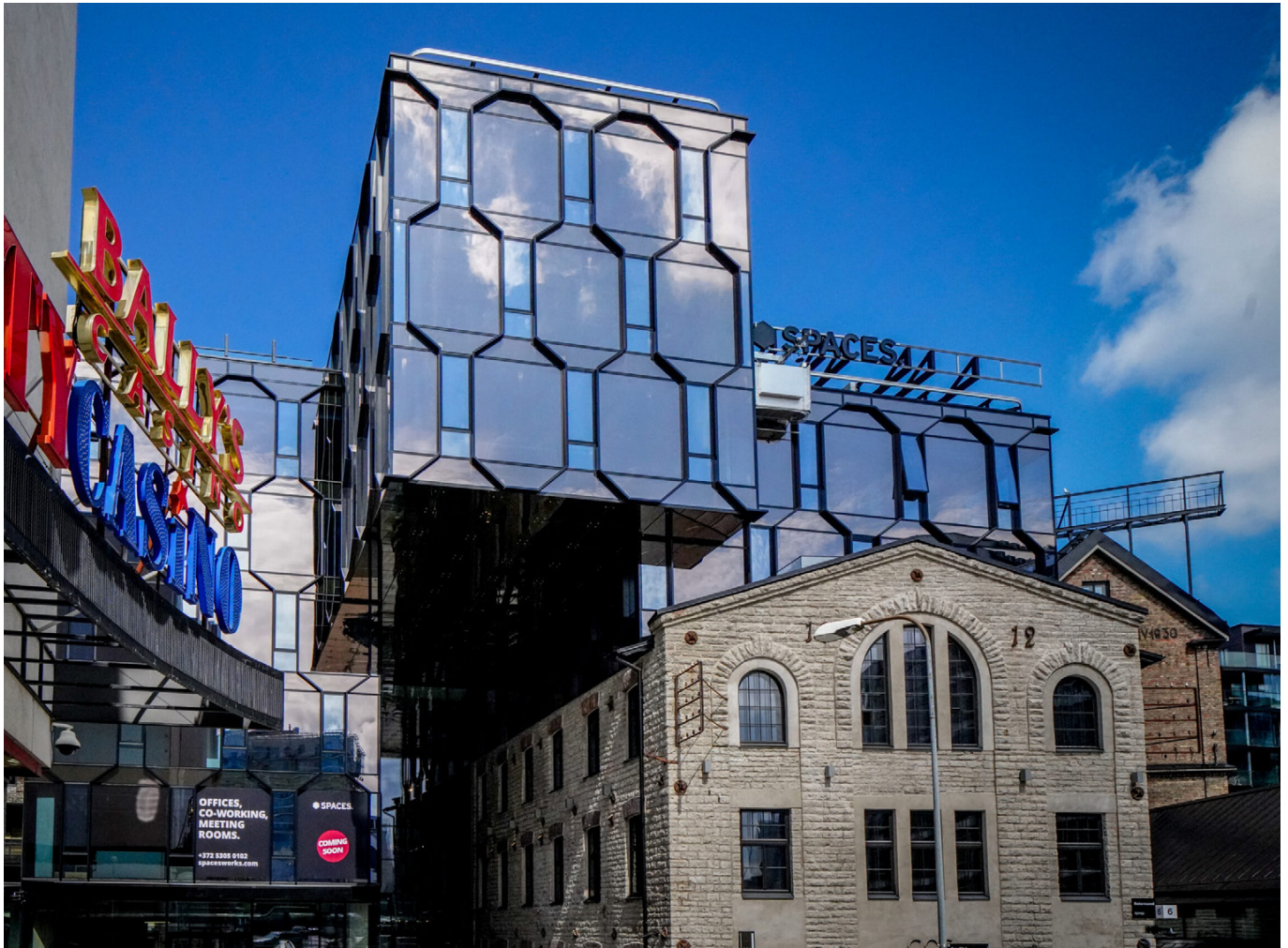
Rotermann Ajamaja.

This building, which will become a gardening complex with rooms for storing plants to aid the maintenance of parks, was still in the early construction phase. It's planned to house a winter garden and storage space for ornamental plants brought in for the cold seasons. It will also contain a greenhouse where other exotic plants can be stored for use in parks during the summer.