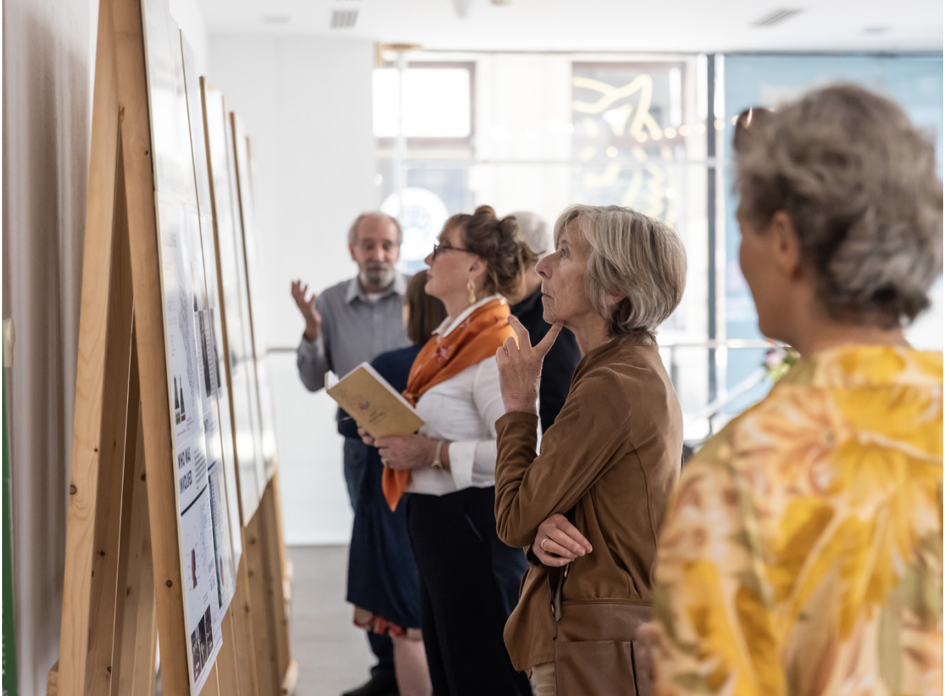
'Reimagining Elderhood' exhibition.

The 'Reimagining Elderhood' exhibition explores the future housing needs of middle-aged people in Ireland, and the role of community-led initiatives and architecture in providing innovative responses to this opportunity and challenge.