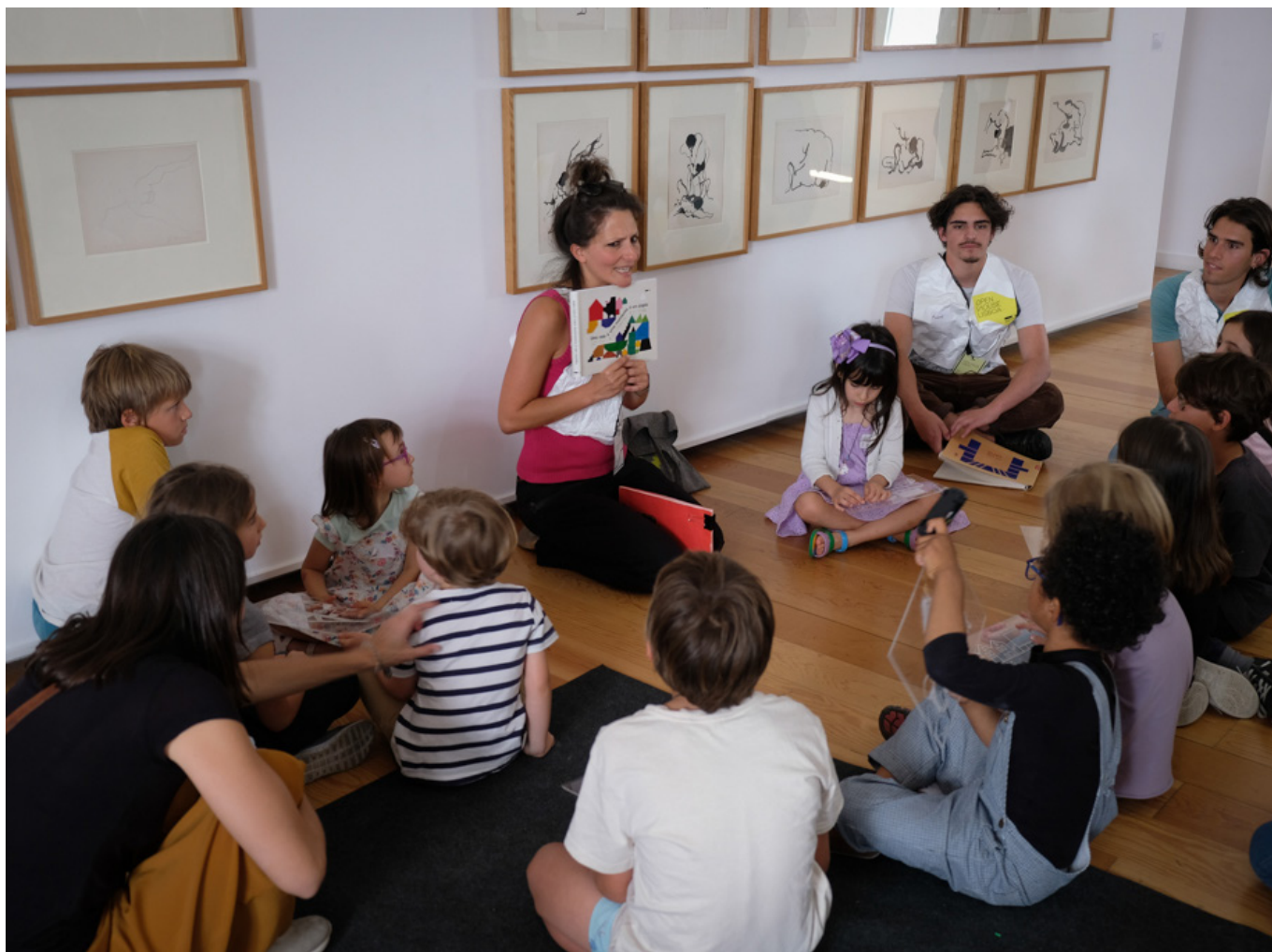
Open House Lisbon 2023.