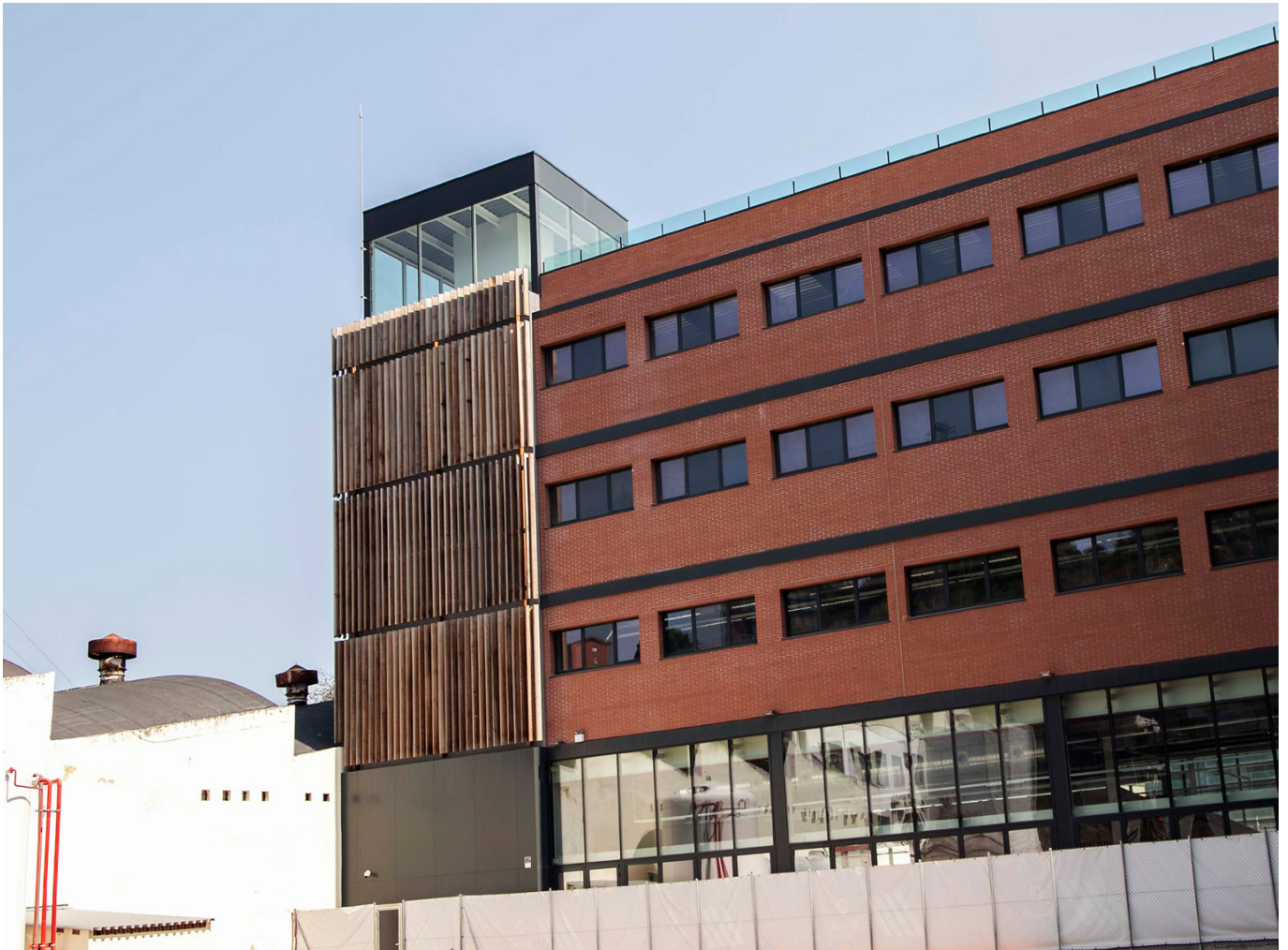
Beta II—As Fabrik

The original building is part of the industrial complex, designed by Francisco García Alquegui and Juan José Abrisqueta in 1963. After many years in a state of abandonment, the building has been refurbished and now houses a university. The Beta II refurbishment project is an example of how reconvertng buildings makes more sustainable use of built heritage, as opposed to tearing down an old building and building a new one, with the amount of energy that entails. The building is a modern space but gives a glimpse of its past, allowing visitors to understand the importance of regeneration and reuse in a sustainable city.