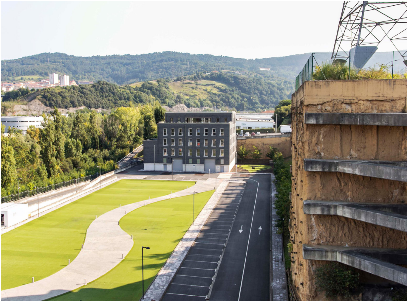
Etxebarri Storm Tank

Storm tanks are huge reservoirs created to store rainwater. They are key infrastructures for a more sustainable city for many reasons. Firstly, they reduce the possibility of flooding, so they are key elements for climate change adaptation. Secondly, they collect the initial rainwater, which is the most polluting because it carries all the dirt accumulated in the streets and on the asphalt. The tanks retain and purify this rainwater so it can return to nature in a better condition.