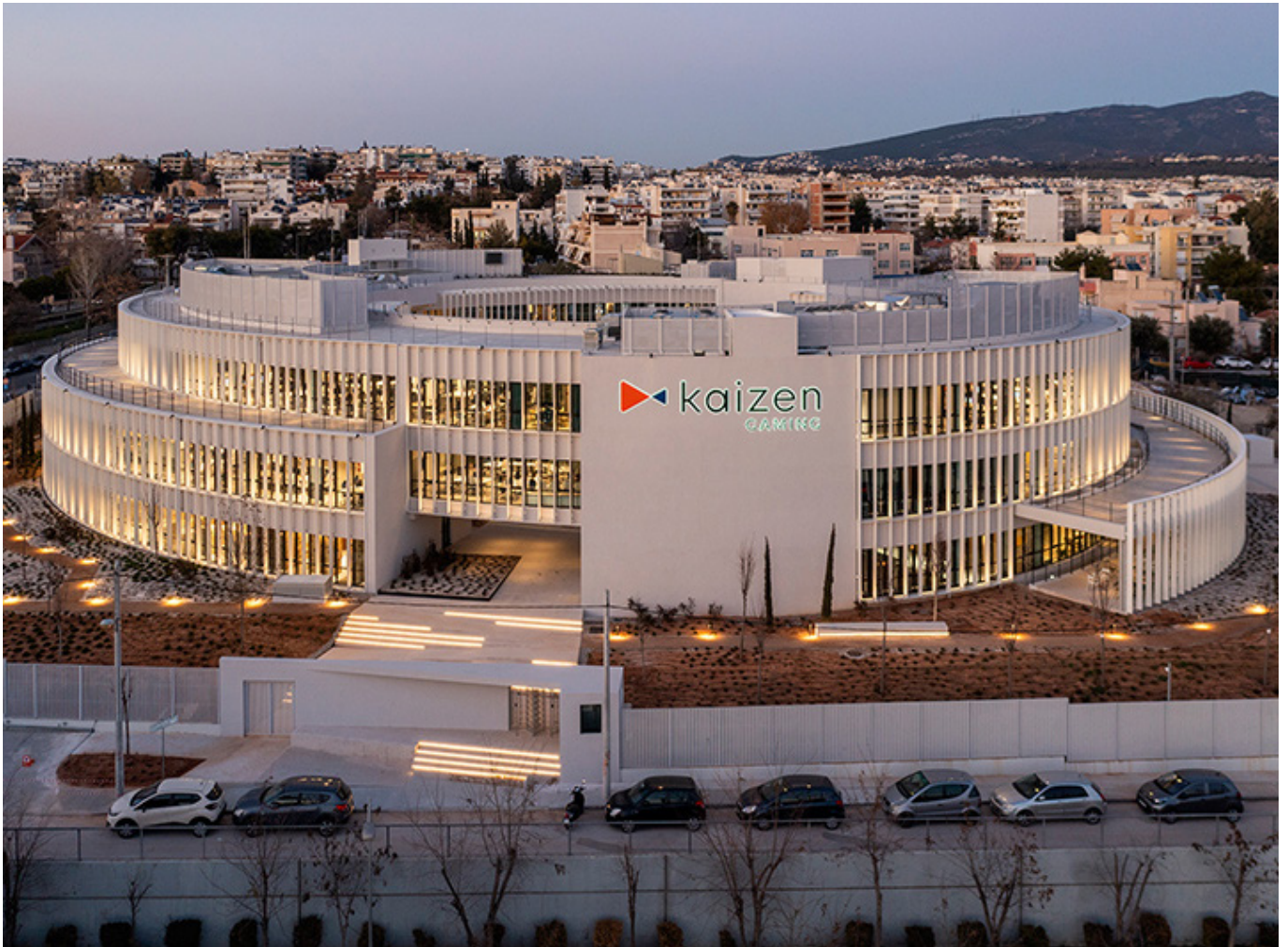
Kaizen Campus.

The new office building of Kaizen Gaming, completed in 2023 by the architectural firms ASPA-KST and Urban Soul Project, in collaboration with co-development companies Dimand and Prodea, with Prodea as the project owner. The building is expected to be certified under the international sustainable development certification system LEED.