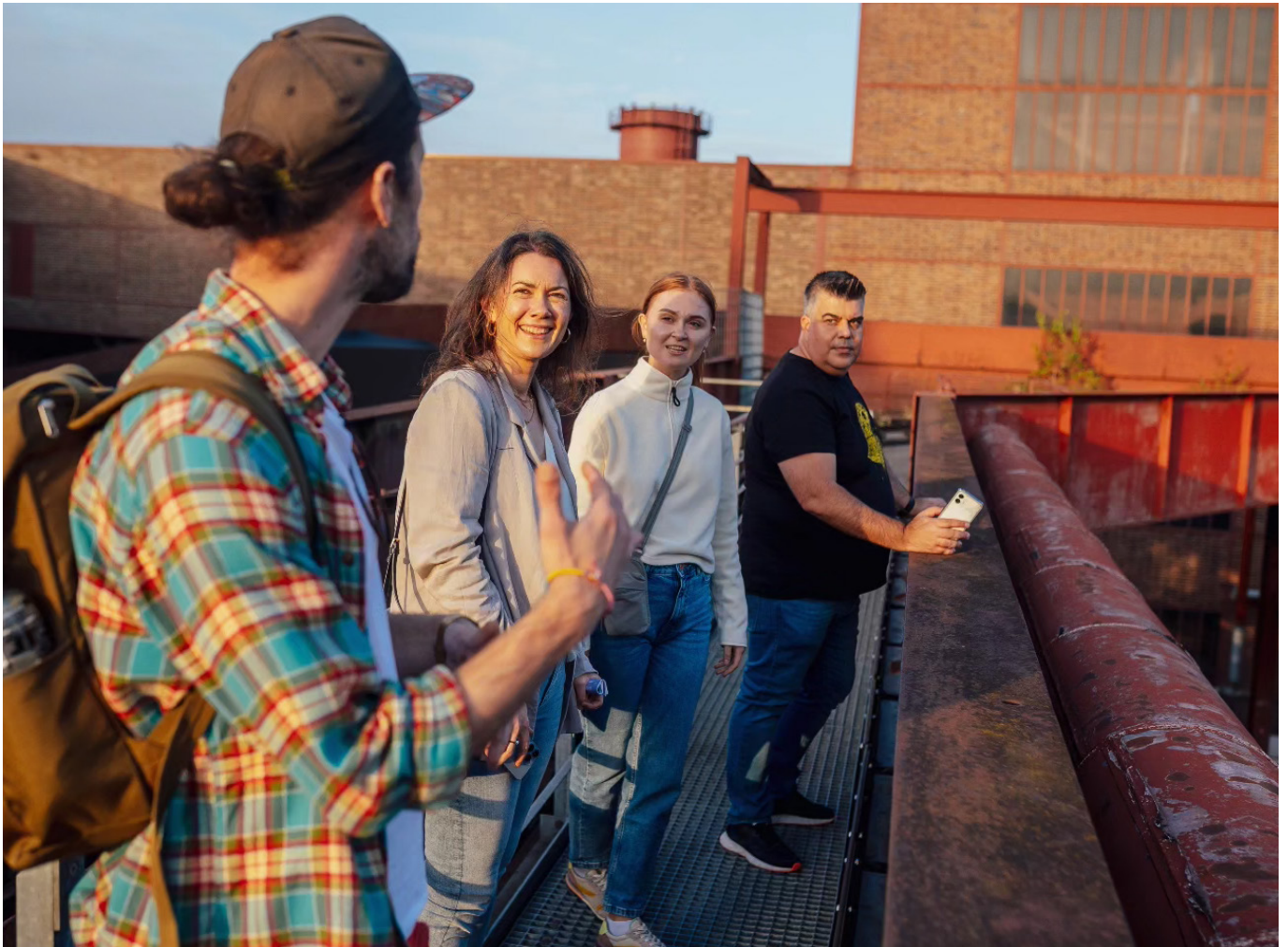
Open House Essen 2023.

Between October 7–8, the third edition of Open House Essen took place, featuring free tours, guided visits and a variety of other activities. From 10 am to 6 pm each day, buildings typically inaccessible to the public were opened for exploration, allowing visitors to discover architecturally intriguing places