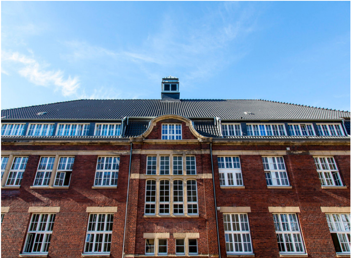
Direktion Zeche Zollverein.

The building is also located at the UNESCO Zollverein Site. The management building, a two-storey brick building in neo-baroque style, was built in 1906 according to plans by the Stolze architectural office. After its completion, it was home to the management and, from 1920 to 1986, the administration of the Zollverein colliery. The building was also home to the mine surveyor's office, which determined the boundaries of minefields. After extensive redevelopment, the Zollverein Foundation moved into the directorate in April 2013. It is a great example of sustainable redevelopment and reuse of existing buildings.