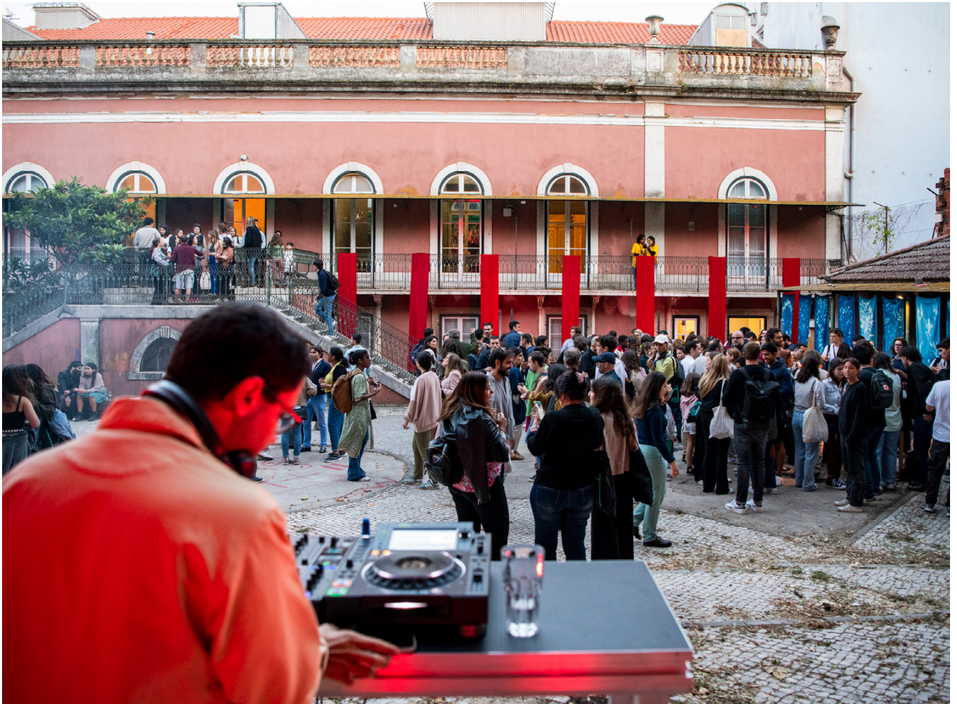
Closing Party.