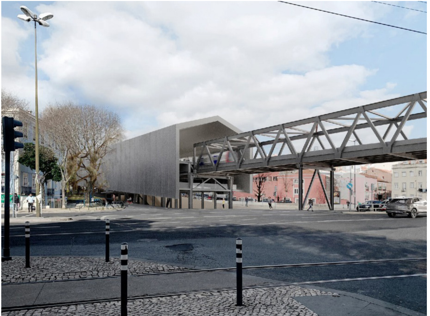
Vale de Alcântara. Photo by Atelier Aires Mateus © Courtesy of Trienal de Arquitectura de Lisboa

Alcântara and its valley have always been a city area undergoing major transformations where infrastructures become visible—the aqueduct in the 18th century, the road structures of Duarte Pacheco in the 20th century, the passage of the railroad and, more recently, the unobtrusive wastewater treatment plant. This area, apparently orderly and full of functions, nevertheless remains a space of opportunity and expansion for Lisbon; if not in terms of buildings, with meanings and connections. There is currently another major public infrastructure project underway, the extension of the Metro network, and with it comes the promise of a new station and intermodal connection that will transform the neighbourhood and the city.