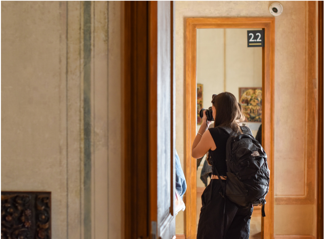
Ziller-Loverdou Mansion.