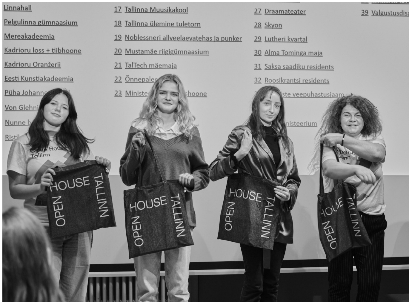
Thank-you event.

Aiming to expand the urban environment and enrich one of the locations in the programme, an event to clean up an old, welded-shut bunker space was held. This initiative invited volunteers to actively participate in transforming the urban landscape and through unlocking and rejuvenating this space, add new dimensions to the cityscape.