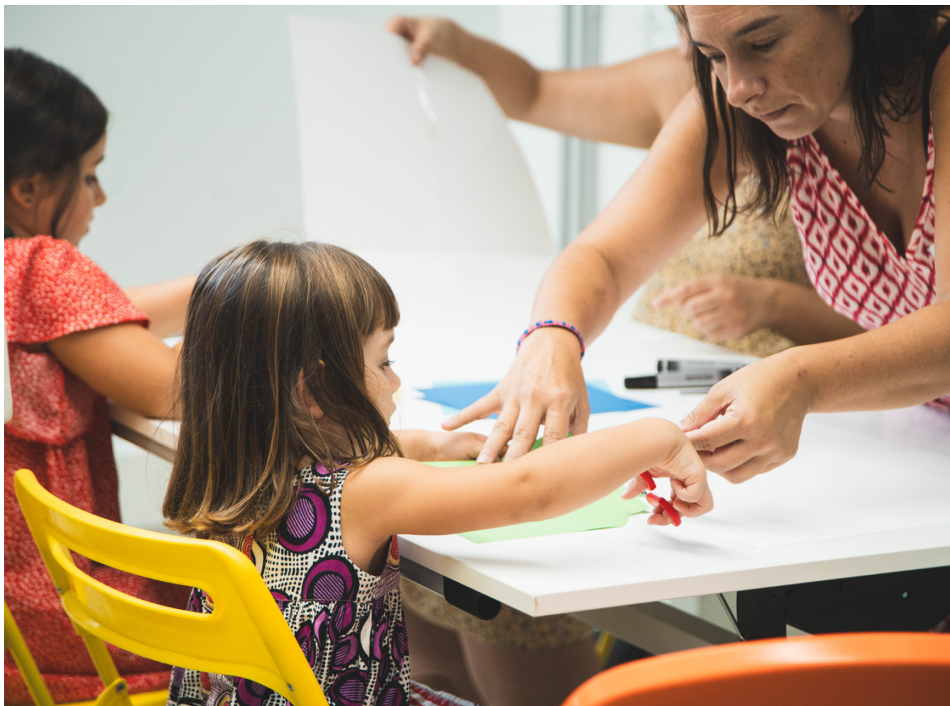
Open House Bilbao 2023.

The Open House Bilbao 2023 festival had 3 other activities from the festival's programme dedicated to showcasing the OHEu Annual Topic: Sustainability, Building Futures Together.