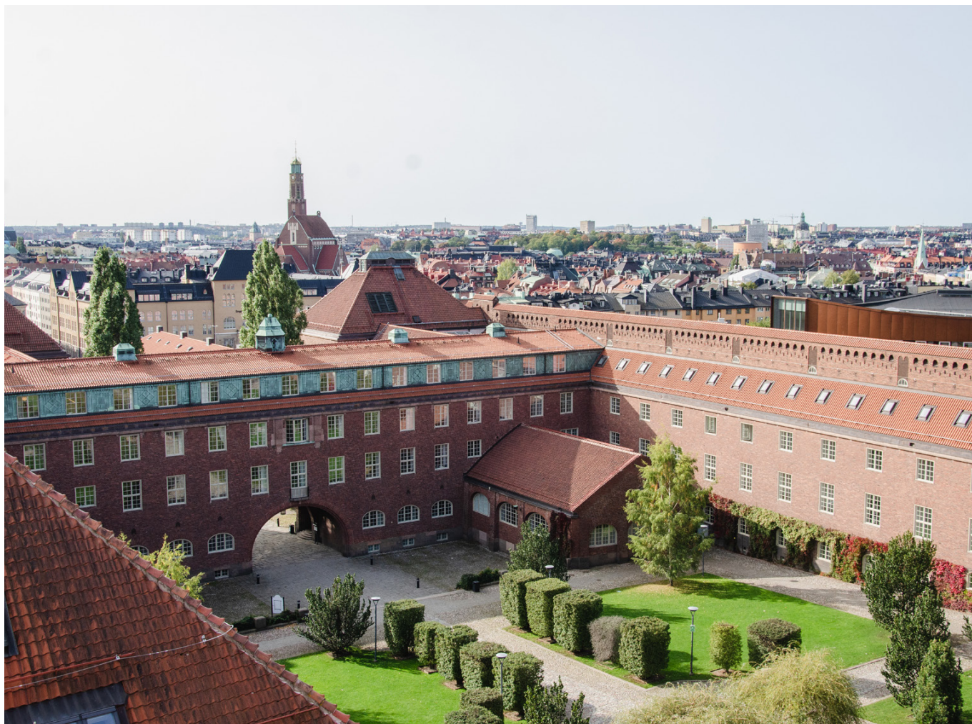
KTH Royal Institute of Technology Campus.

When KTH's campus opened in 1917, it marked not only a milestone in academia but also a commitment to sustainable practices that continues today. The campus, hosting cutting-edge research facilities and adorned with art from prominent artists of the time, has evolved into a model of sustainability.