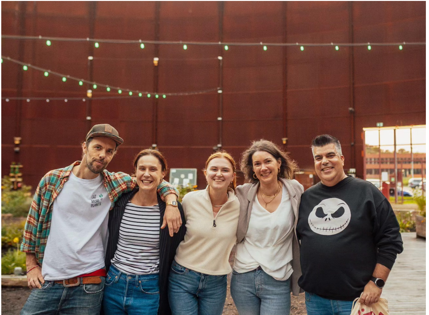
Open House Essen 2023.

Open House Essen 2023 had 2 guided tours in English, with 70 visits/attendees. 1 guided tour was in Turkish 1 guided tour was in Arabic.