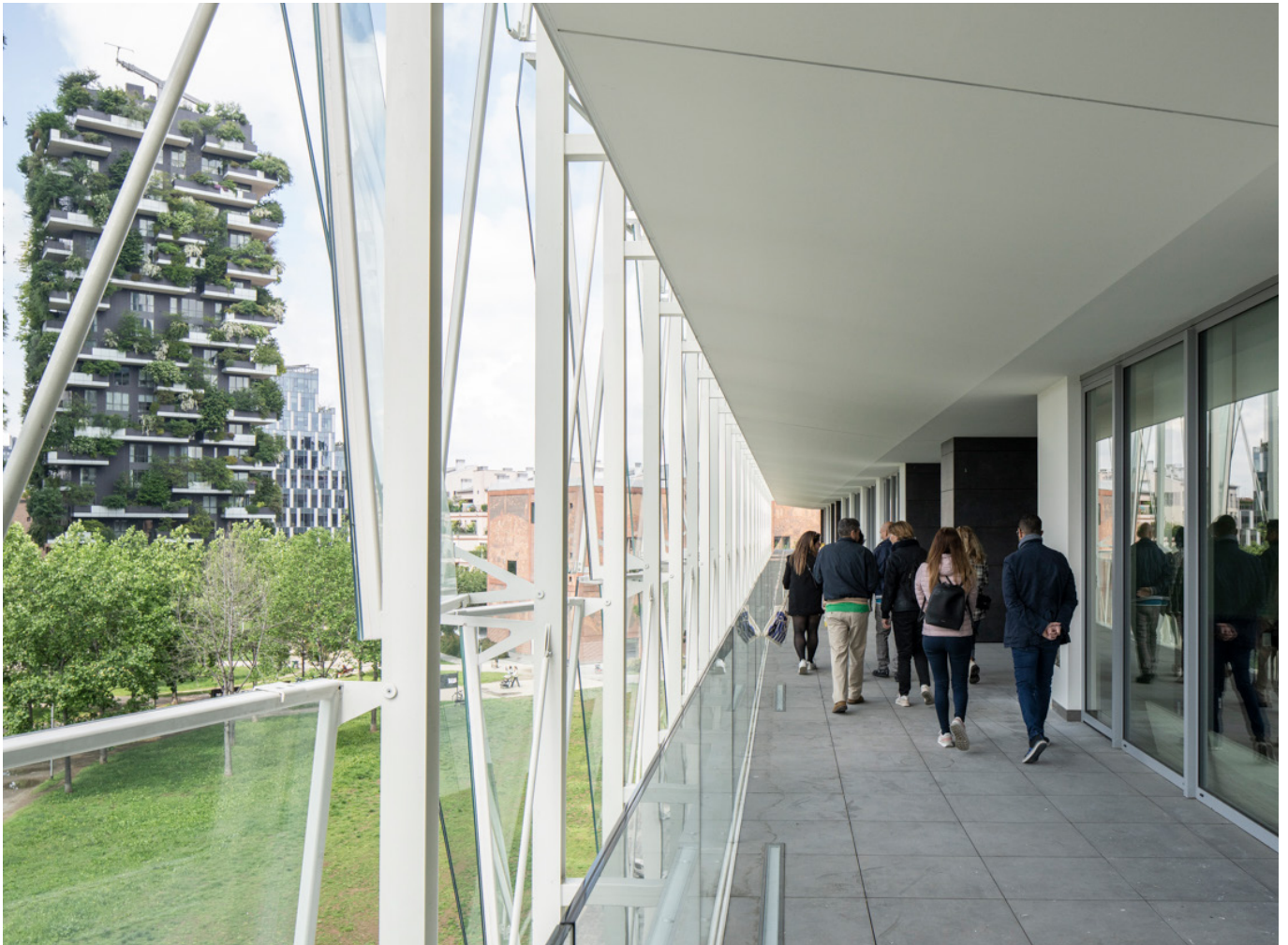
De Castilla.

Open House Milan 2023 had 7 buildings that had guided tours in English that had approx. 30 visits.