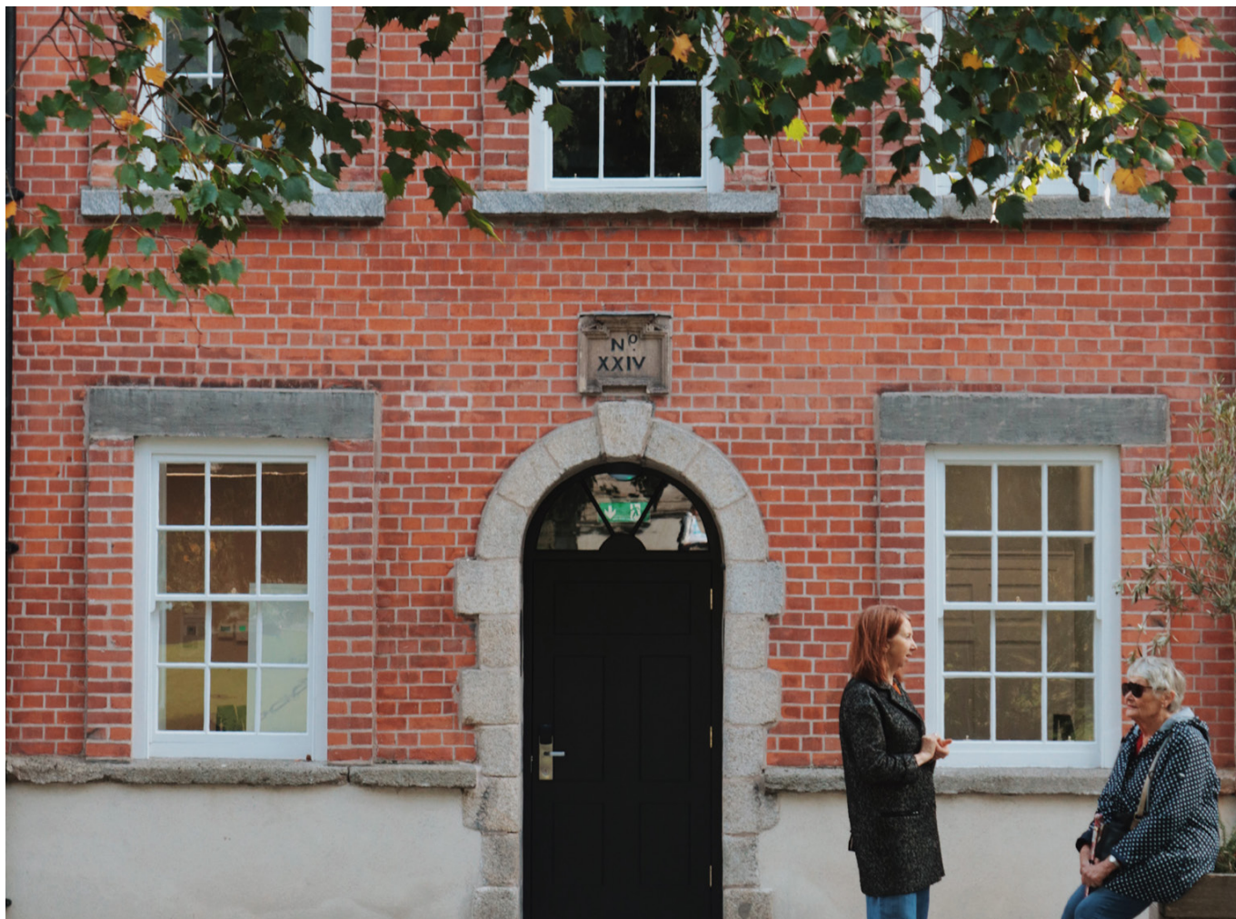
The Rubrics Building.

The iconic Rubrics building is Trinity's oldest building, dating back to 1700, and the only surviving structure of the original Library Square. In 2023, Trinity College completed a project to refurbish and conserve the building. The project aimed to deliver a diverse range of accommodations, including 22 studio/one-bedroom residential units, 9 study bedrooms with communal facilities and research/study rooms.