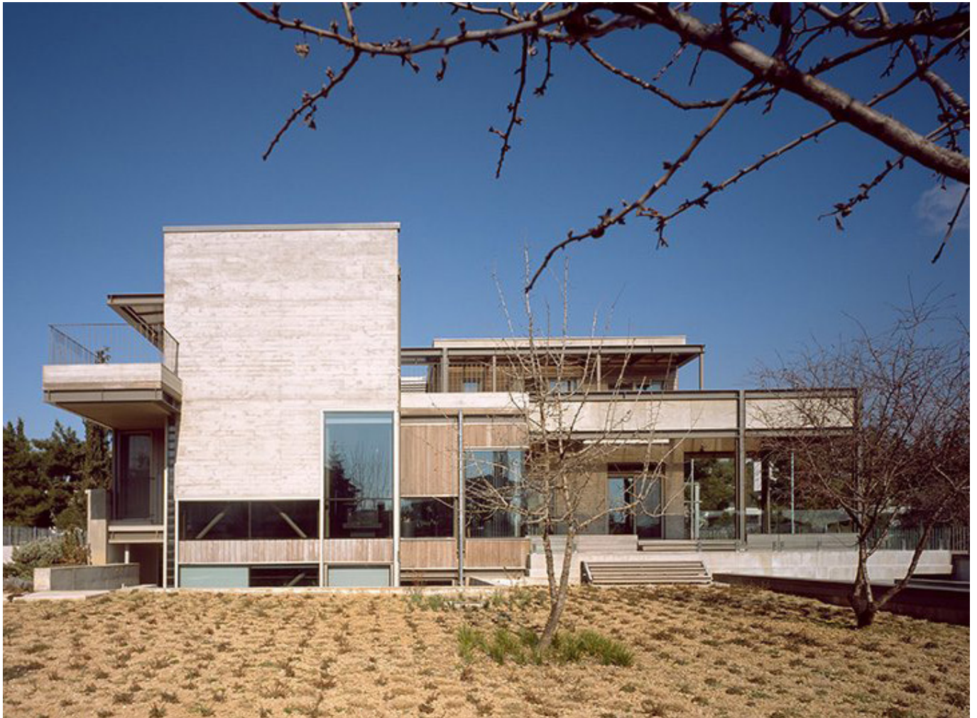
Residence in Pylaia.

This family house addresses contemporary living with sustainable features in a very interesting way. It was constructed in 2008, combining elements of modern design such as metallic frames, wooden panels and concrete. Simple lines, unique materials and the connection between the interior and the exterior are some of the elements worth attention. The orientation of the residence, the solar panels, the type of insulation and the creation of a rich, Mediterranean garden are all governed by bioclimatic principles.