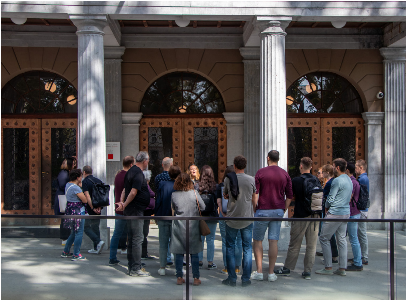
Kazina Palace.

One of Ljubljana's historical icons, the Kazina Palace, was built as the palace of the Kazina Society at the beginning of the 1830s and is part of the category of buildings that have been adapted for reuse. It is considered one of the few preserved multifunctional public palaces and one of the highest-quality pieces of architecture from the first half of the 19th century in Slovenia. Shortly after its construction, it became the centre of lively city life and now hosts the University of Ljubljana's Academy of Music. In 2015, due to the Academy's spatial constraints, efforts to renovate and repurpose the building began. The large-scale renovation project included the renovation of the façade and the large hall, whose original painted ceiling was preserved. The entrance hall, staircase and corridors were renovated and individual elements such as stucco, paintings, floors, stoves, lamps and other decorations from the beginning of the 20th century were restored. The renovated rooms are complemented and connected by modern, functional architectural elements.