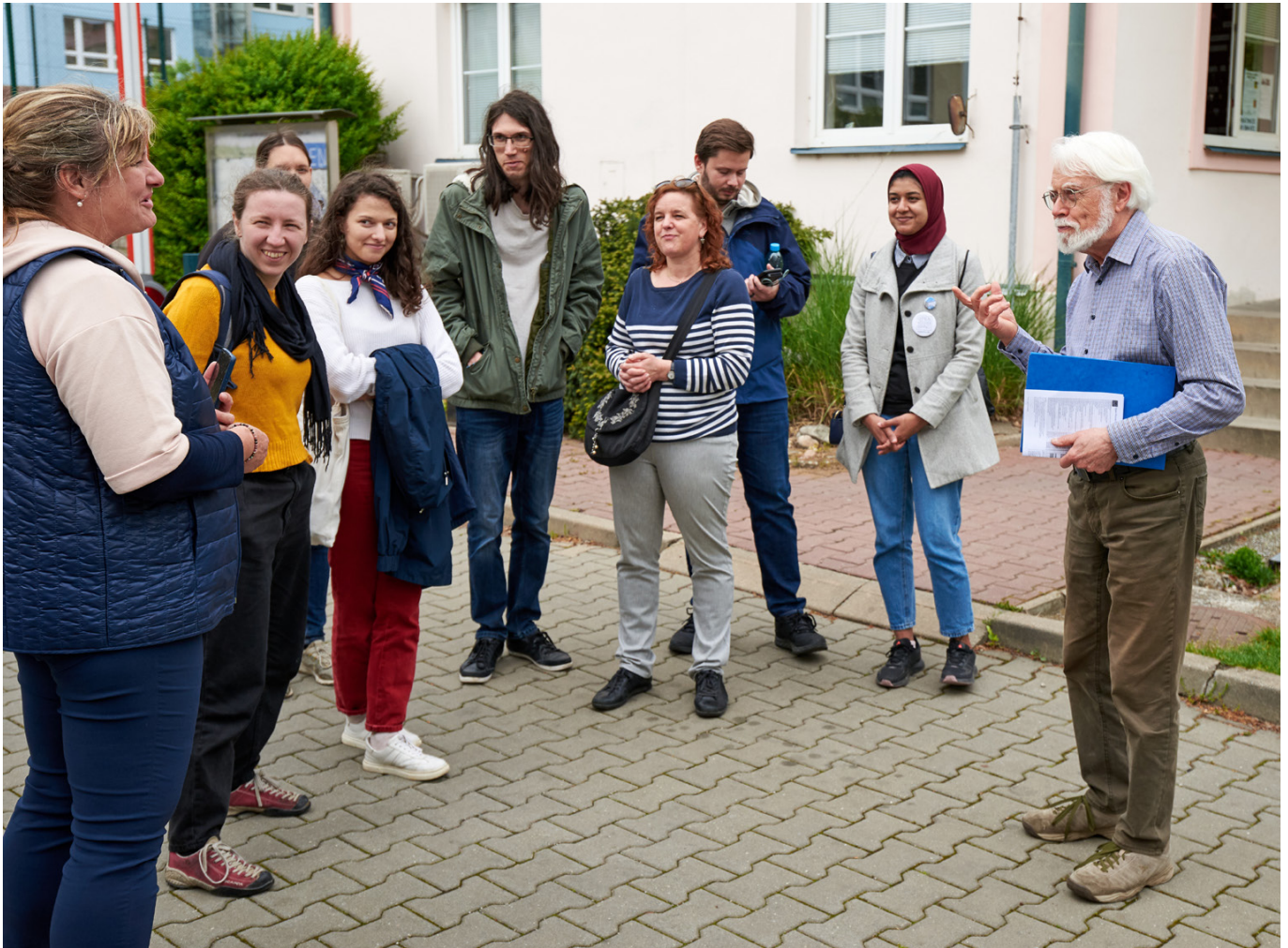
Open House Brno 2023.