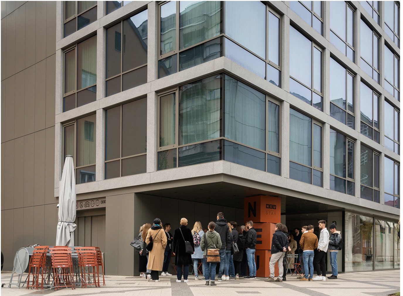
NEU residences.

This building falls into the second aforementioned category. NEU Residences is a hybrid with 55 serviced apartments that cater to business and leisure travellers as well as guests on extended stays. NEU residences hold the Green Key certificate, which stands for their commitment to act sustainably in all areas of their operations.