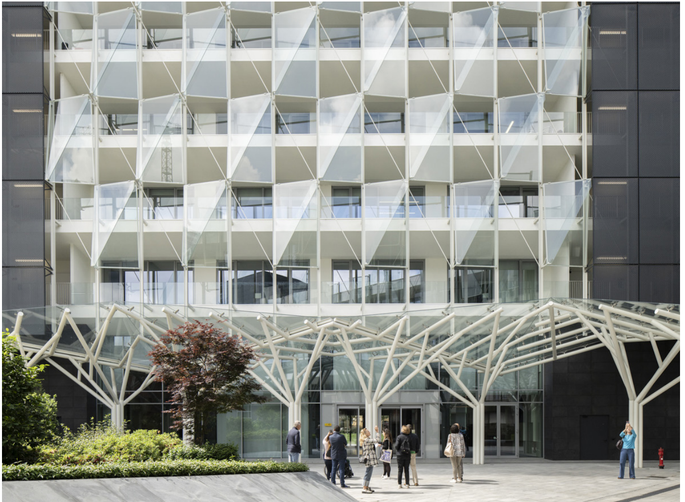
De Castillia.

A myriad of triangular glass elements crossed by diagonal metal lines covers the two V-shaped volumes of De Castillia 23, embracing the protruding terraces on each floor. 1100 m 2 of dynamic glass structures create ever-changing games of light. Progetto CMR has re-designed a characterful architectural site that is in dialogue with the surrounding, innovative context of Porta Nuova. The glass second skin ensures the diffusion of natural light into the buildings, significantly reducing the use of artificial lighting during working hours. The photovoltaic system built into the roof produces clean energy, avoiding the emission of 13 tonnes of CO 2 into the atmosphere every year. Heating and cooling are ensured by heat pumps using groundwater, utilising geothermal energy without releasing pollutants.