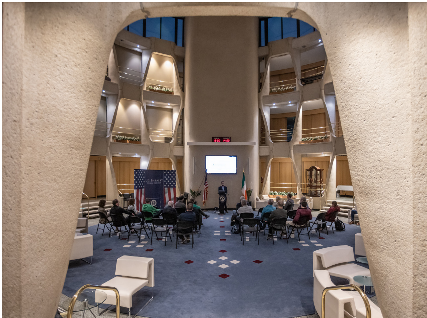
US Embassy Dublin.

In September 2023, the Open House Dublin team organised a lunch meeting in the Dublin city centre. It was held between 12:00–14:00 at a local hotel, and the invitation went out to all of those interested in volunteering for Open House Dublin 2023. Tea, coffee and sandwiches were provided and the OHD team were present to provide information and answer any questions. This allowed the team