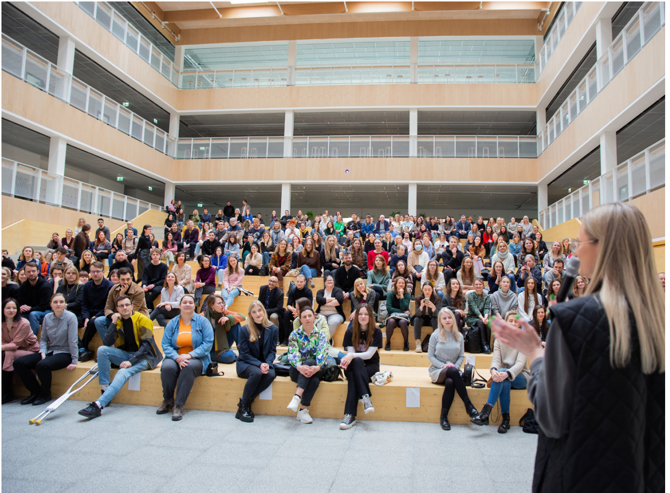
Training of volunteers.