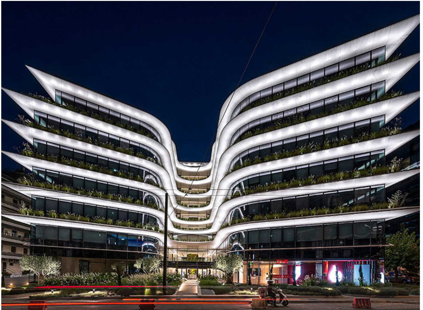
The Orbit.

Redesign of a 9-story office building, with façade architectural design by Lianou Chalvatzis Architects and architectural design (excluding façades) by Lianou Chalvatzis Architects / I & A Vikelas & Associates Architects. It is certified at the highest level (Platinum) for sustainability according to the LEED system and has received Gold certification from WiredScore for its high digital connectivity.