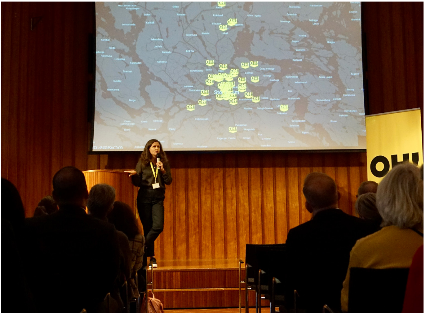
Premiere event.