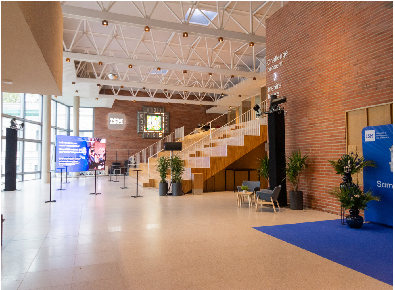
ISM University of Management and Economics.

This building housed one of the first banks in Vilnius and is a great example of harmonious historicist architecture in the city. Its function changed three times—from a bank building to the Central Post Office designed by the architectural team of the Nasvytis Brothers and now, a newly equipped, modern Western university. The most recent reconstruction had to organically fit into the long history of the building. The architects had to adapt the building to the needs of the university and ensure it would be comfortable and convenient for its new residents. At the same time, they had to preserve and incorporate the unique heritage of the Nasvytis Brothers into a building being renovated in a modern Scandinavian style.