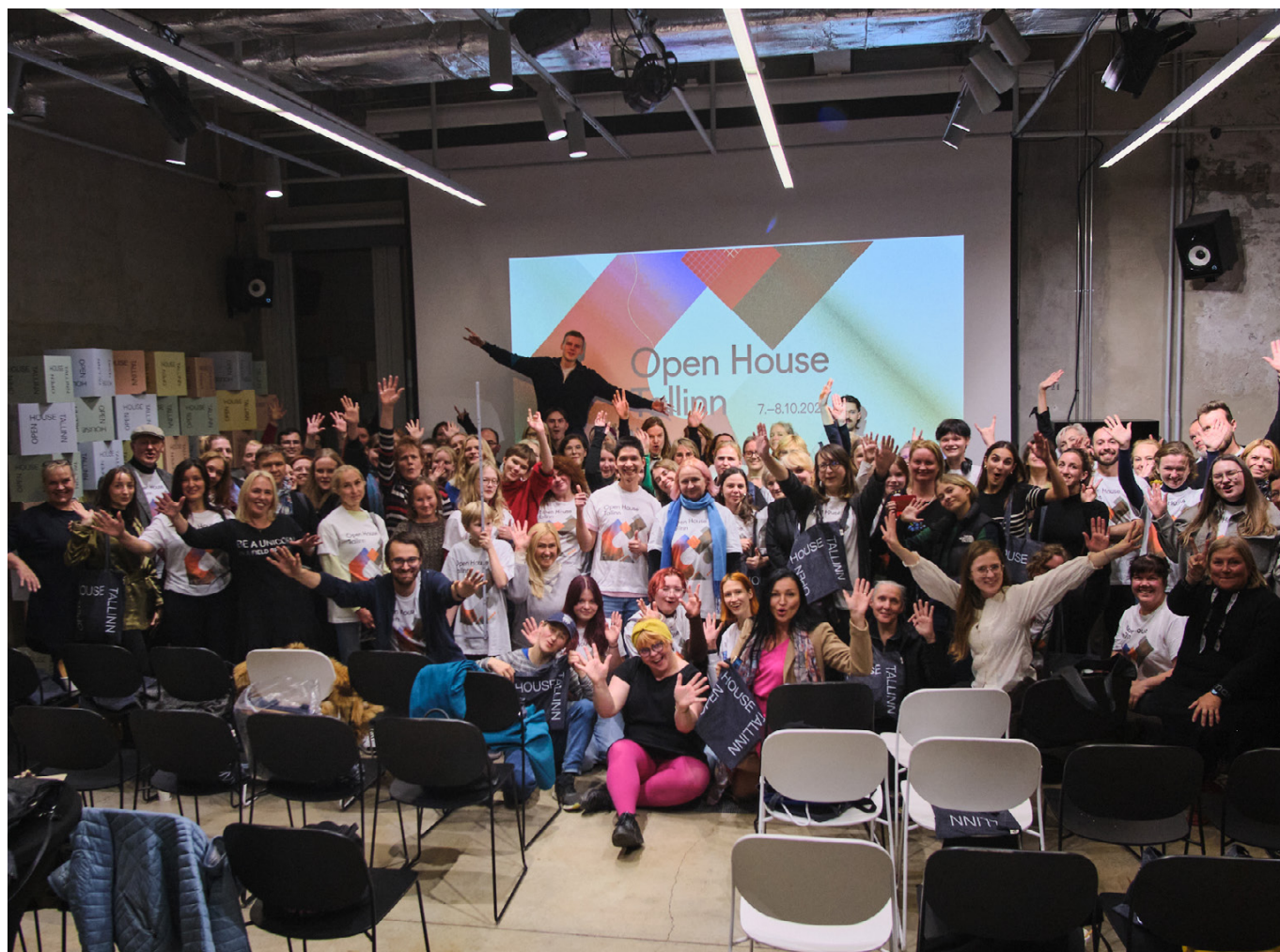
Thank-you event.

These on-location training events are designed for volunteer guides to familiarise themselves with their respective venue, the tour route, managers, architects and other individuals specific to the venue. These people provide additional insights about the location and share interesting facts that might not be commonly known. These events are crucial